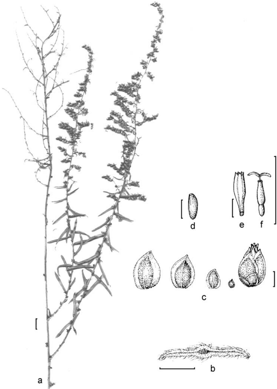
Fig. 1. Artemisia jordanica – a: previous year's flowering shoot with two flowering branches; note the undivided first order leaves and the minute axillary second order leaves; b: leaf cross section showing the appressed-silky indumentum; c: inner and outer phyllaries and capitulum; d: achene; e: staminate flower; f: pistillate flower. – Scale: a = 10 mm, b-f = 1 mm); after/from the type collection.