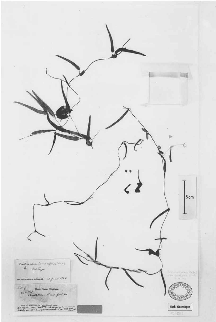
Fig. 1. Aristolochia linearifolia – the Wright sheet at Göttingen (GOET) that bears the lectotype specimen, which is the flowering plant in the lower right corner.