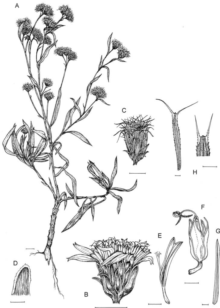
Fig. 1. Isostigma herzogii – A: habit; B: capitulum in flower; C: capitulum at fruiting; D: apex of an inner phyllary; E: marginal flower; F: disc flower; G: palea; H: cypsela. – A, C, F-H after Krapovickas, Mroginski & Fernández 19317 (CTES), B-D after Herzog 617 (G), E after Caballero Mármori 658 (CTES); scale bars: