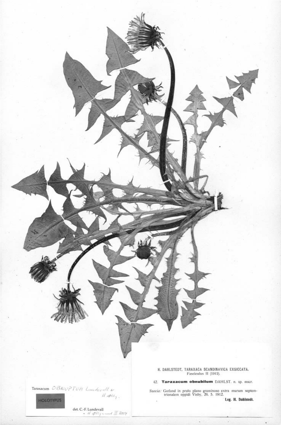
Fig. 5. Taraxacum obnubilum , holotype (S). Downloaded From: https://bioone.org/journals/Willdenowia on 30 Apr 2024 Terms of Use: https://bioone.org/terms-of-use