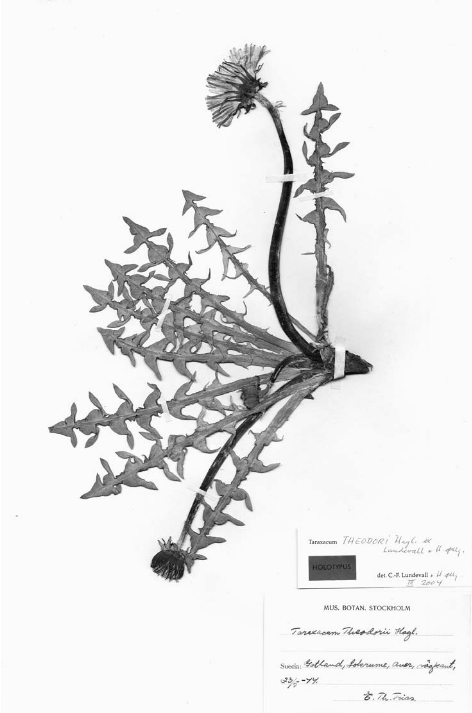
Fig. 7. Taraxacum theodori , holotype (S). Downloaded From: https://bioone.org/journals/Willdenowia on 30 Apr 2024 Terms of Use: https://bioone.org/terms-of-use