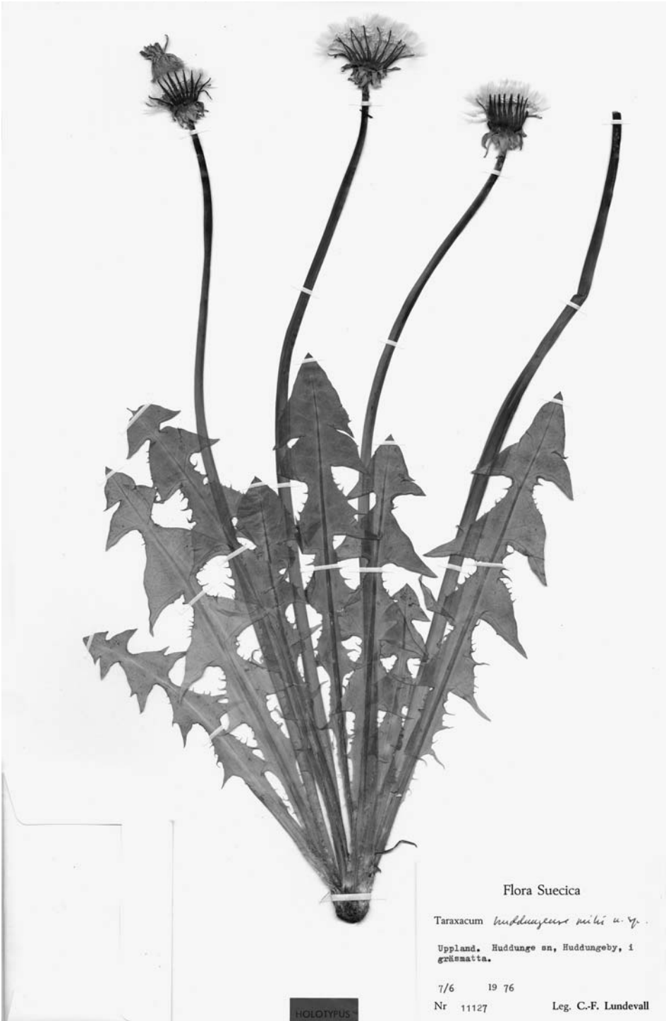
Fig. 4. Taraxacum huddungense , holotype (S). Downloaded From: https://bioone.org/journals/Willdenowia on 30 Apr 2024 Terms of Use: https://bioone.org/terms-of-use