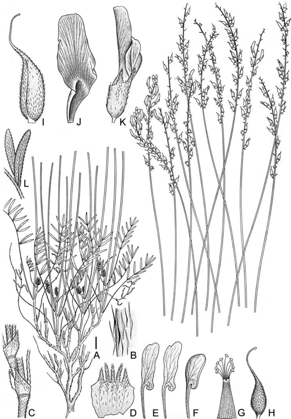
Fig. 1. Astragalus kiviensis – A: habit (with fruits); B: indumentum of calyx; C: stipules; D: calyx; E: wings; F: keel; G: androecium; H: gynoeceum; I: pod; J: standard; K: flower; L: leaflet pair. – Scale bar: A = 1 cm, C, L = 2.5 mm, D-K = 1.25 mm; drawn after the type collection.