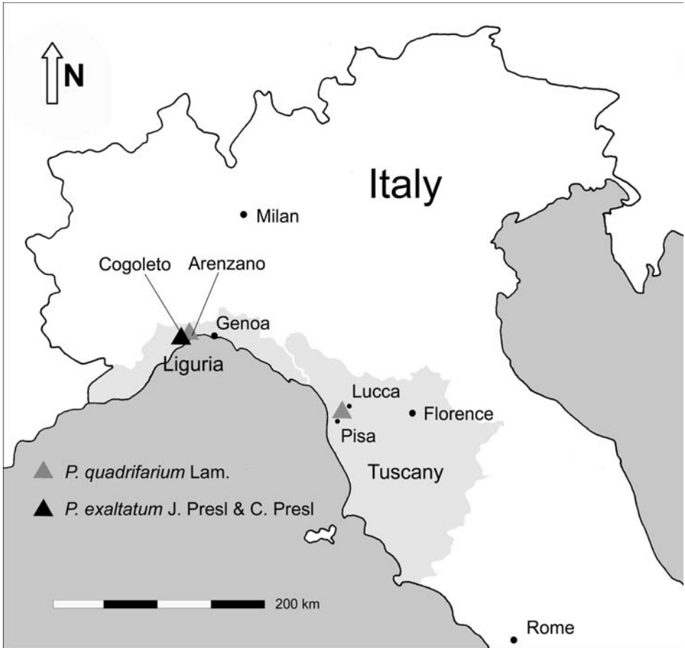
Fig. 3. Distribution of Paspalum quadrifarium and P. exaltatum in Europe.