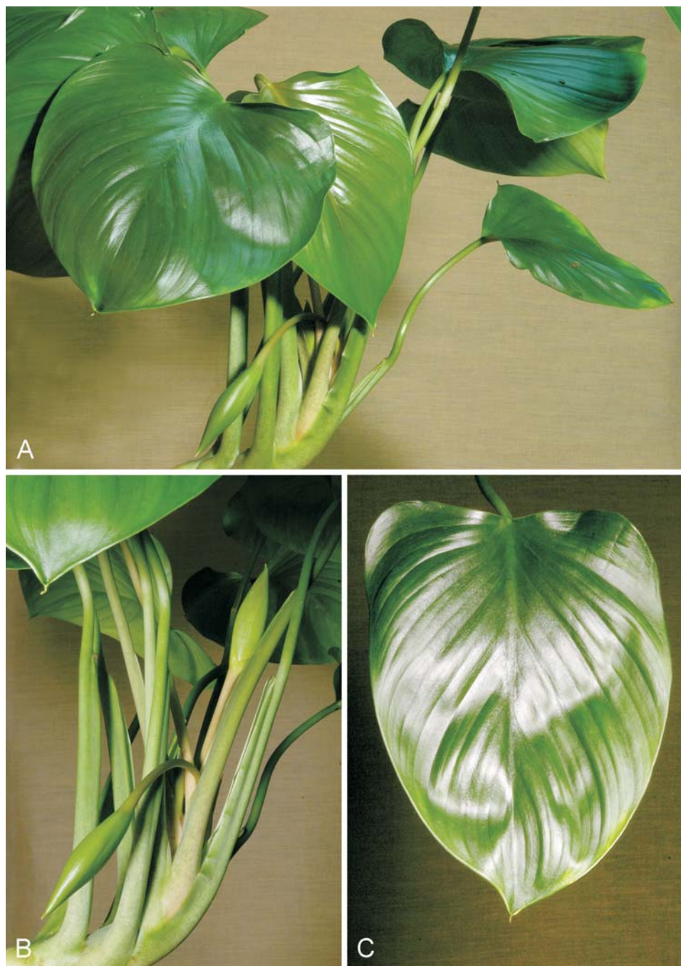
Fig. 1. Homalomena vietnamensis – A: habit of a flowering plant; B: lower part of the plant with two inflorescences, the younger one still erect and the other turned downwards after anthesis; C: single leaf, note the truncate base, the mucronate apex and the glossy upper side of the blade. – Plant cultivated at the Botanic Garden Munich from the same wild source as the holotype. – Photographs by G. Gerlach.