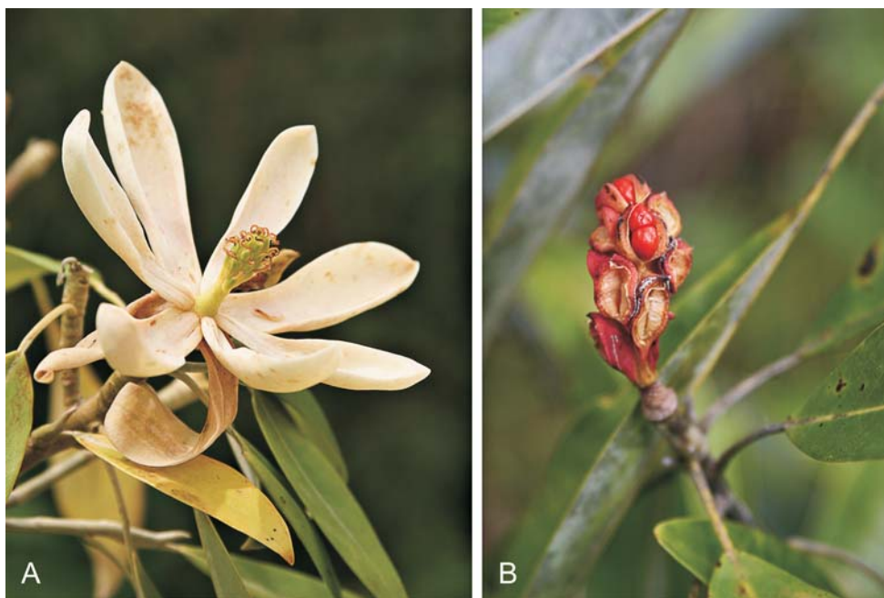
Fig. 2. Magnolia virginiana subsp. oviedoae – A: flower; B: fruit.

Upon closer study we now propose recognition of the Cuban population of Magnolia virginiana as a new subspecies, morphologically distinct from both North American subspecies, M. virginiana subsp. virginiana and subsp. australis (Sarg.) A. E. Murray.