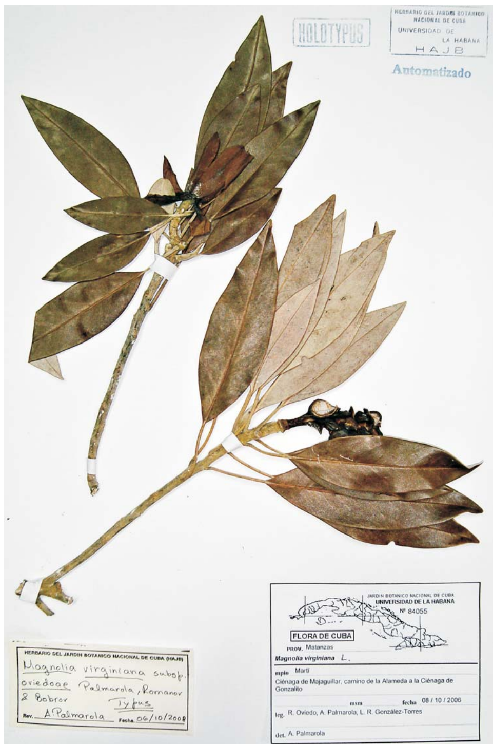
Fig. 1. Holotype specimen of Magnolia virginiana subsp. oviedoae (HAJB).