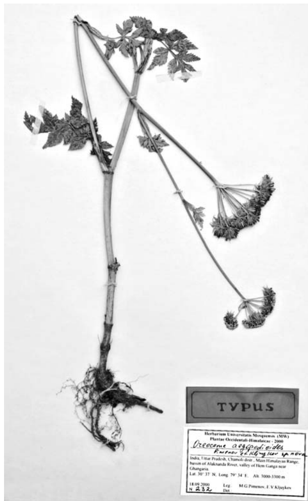
Fig. 3. Oreocome aegopodioides Pimenov & Kljuykov, holotype at MW.

Oreocome nuristanica Pimenov & Kljuykov, sp. nov. Holotype: Afghanistan, "Nuristan, Minjan, Ptili, 2700 m", Edelberg 2130 (W!; isotype: C)