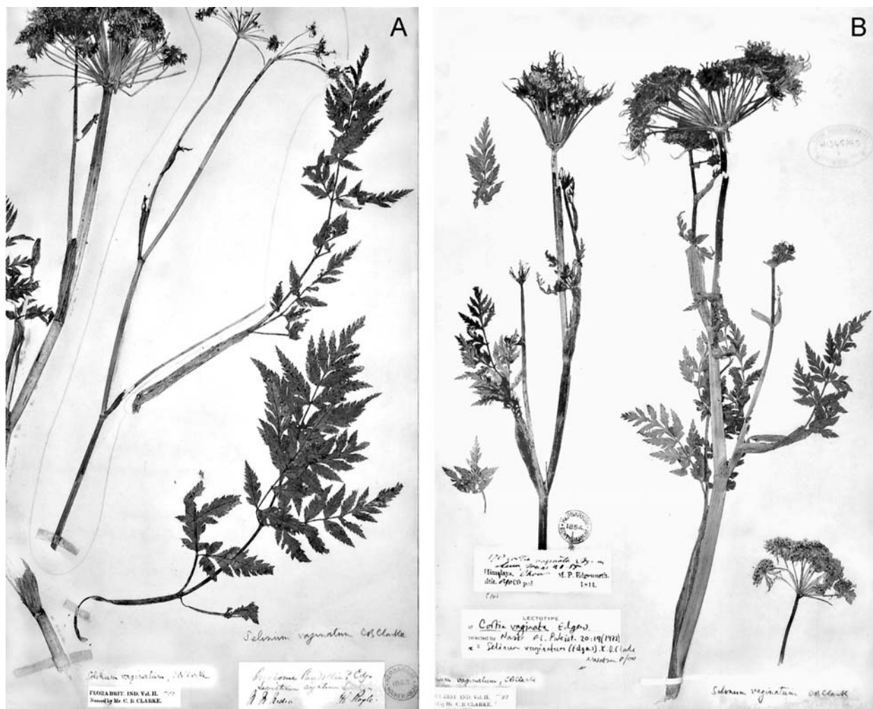
Fig. 1. Type specimens – A: Levisticum argutum Lindl. (K); B: Cortia vaginata Edgew. (K).

The name Selinum vaginatum , widely accepted at present, is based on Cortia vaginata Edgew. (Edgeworth 1845). However, Levisticum argutum Lindl. (Lindley 1835) refers to the same species, as a comparison of their type specimens, both kept in Kew (Fig. 1), revealed. Levisticum is a genus completely absent from the Himalayan flora. The description of L. argutum is rather short, and it is not surprising that the name was almost completely forgotten. Edgeworth (1845) and Clarke (1879) suggested (the latter with some hesitation) L. argutum was conspecific with Cortia elata Edgew. ( \equiv Ligusticum elatum (Edgew.) C. B. Clarke). Mukherjee & Constance (1993), however, did not confirm this synonymy.