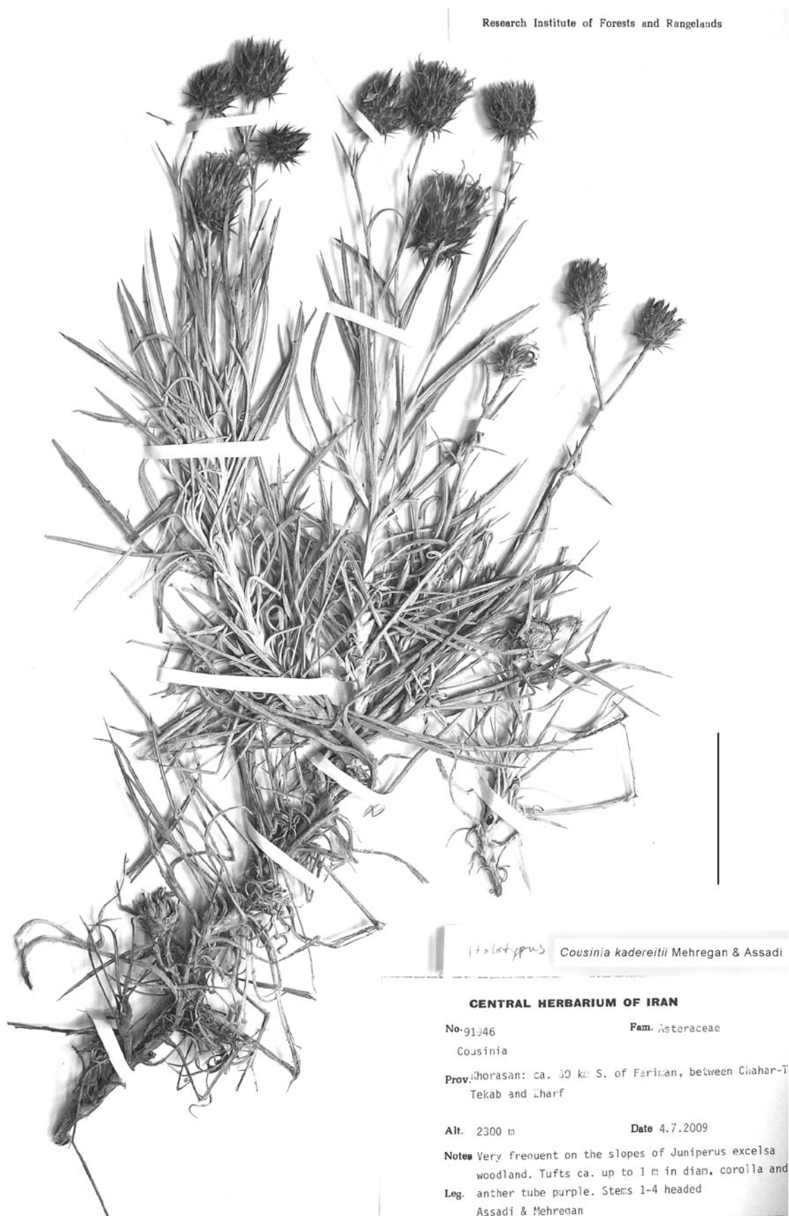
Fig. 3. Holotype of Cousinia kadereitii (Assadi & Mehregan 91946, TARI). – Scale bar = 5 cm.