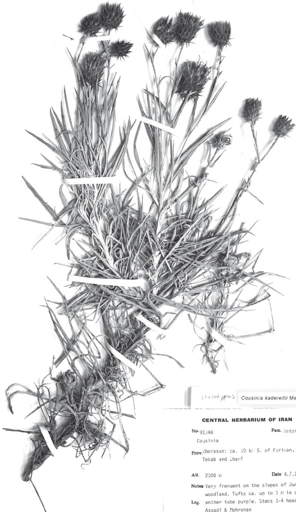
Fig. 3. Holotype of Cousinia kadereitii (Assadi & Mehregan 91946, TARI). – Scale bar = 5 cm.

Research Institute of Forests and Rangelands