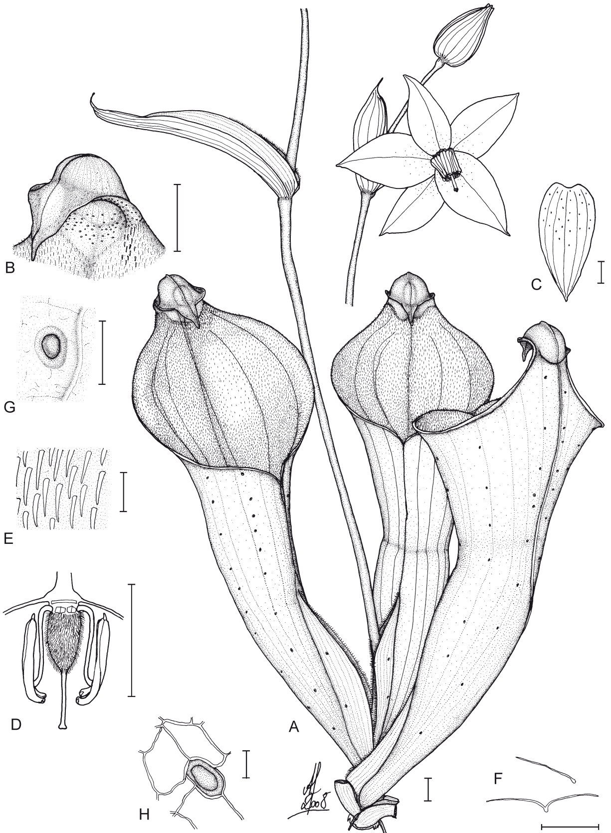
Fig. 1. Heliamphora uncinata – A: habit of flowering plant; B: pitcher appendage; C: perianth segment; D: diagrammatic section of flower at anthesis; E: trichomes of upper interior leaf surface; F: trichomes of exterior leaf surface; G: nectar gland of pitcher exterior surface; H: nectar gland from tepal base. – Scale bars: A–D = 10 mm, E = 0.3 mm, F, H = 0.1 mm, G = 1 mm. – Drawing by Andreas Fleischmann from Steyermark & al. 128568.