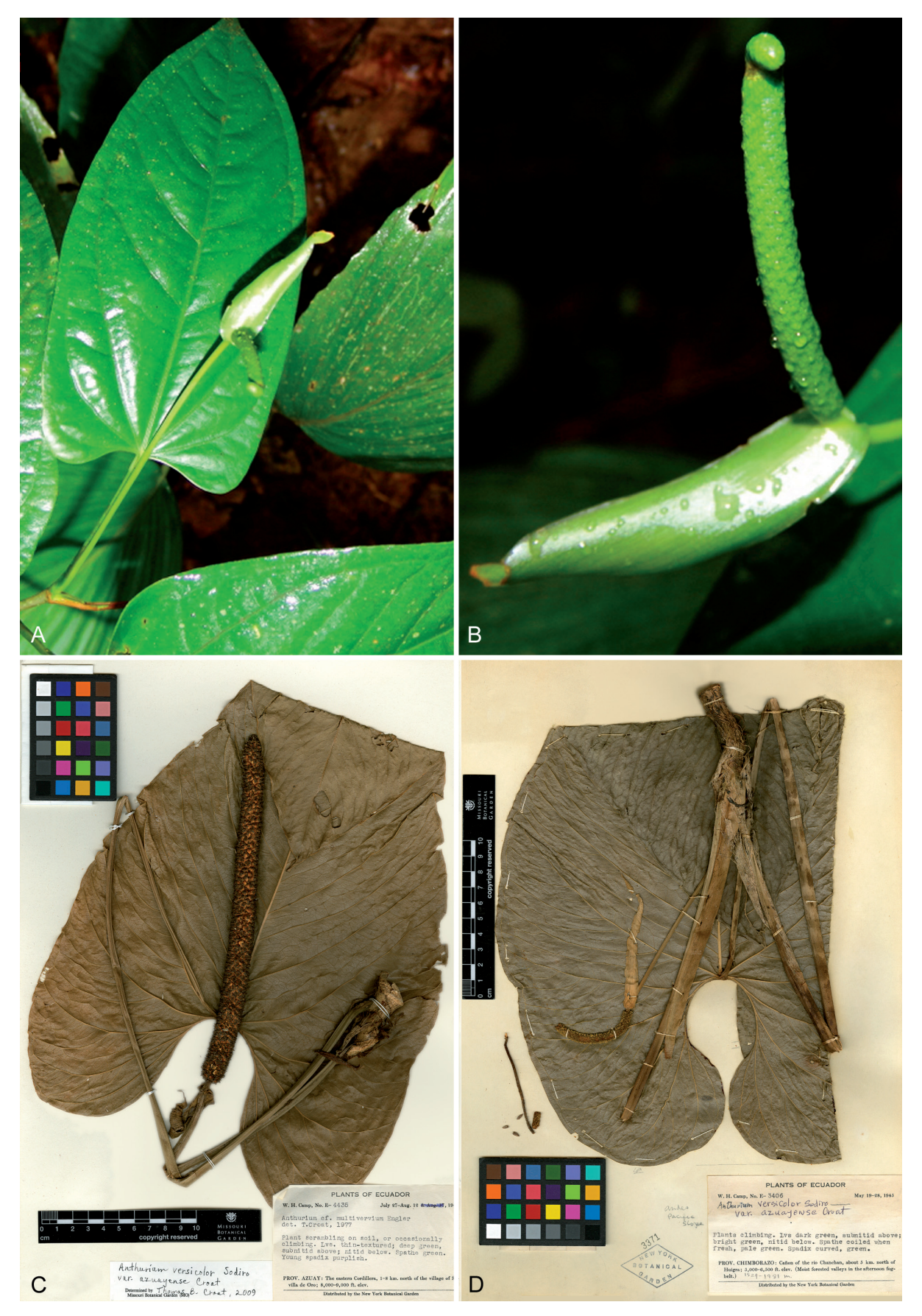
Fig. 3. A–B: Anthurium patens – leaf blade, adaxial surface and inflorescence (A); inflorescence, close-up (B); C–D: A. versicolor var. azuayense – type specimen, Camp E-4435; D: paratype specimen, Camp E-3406.