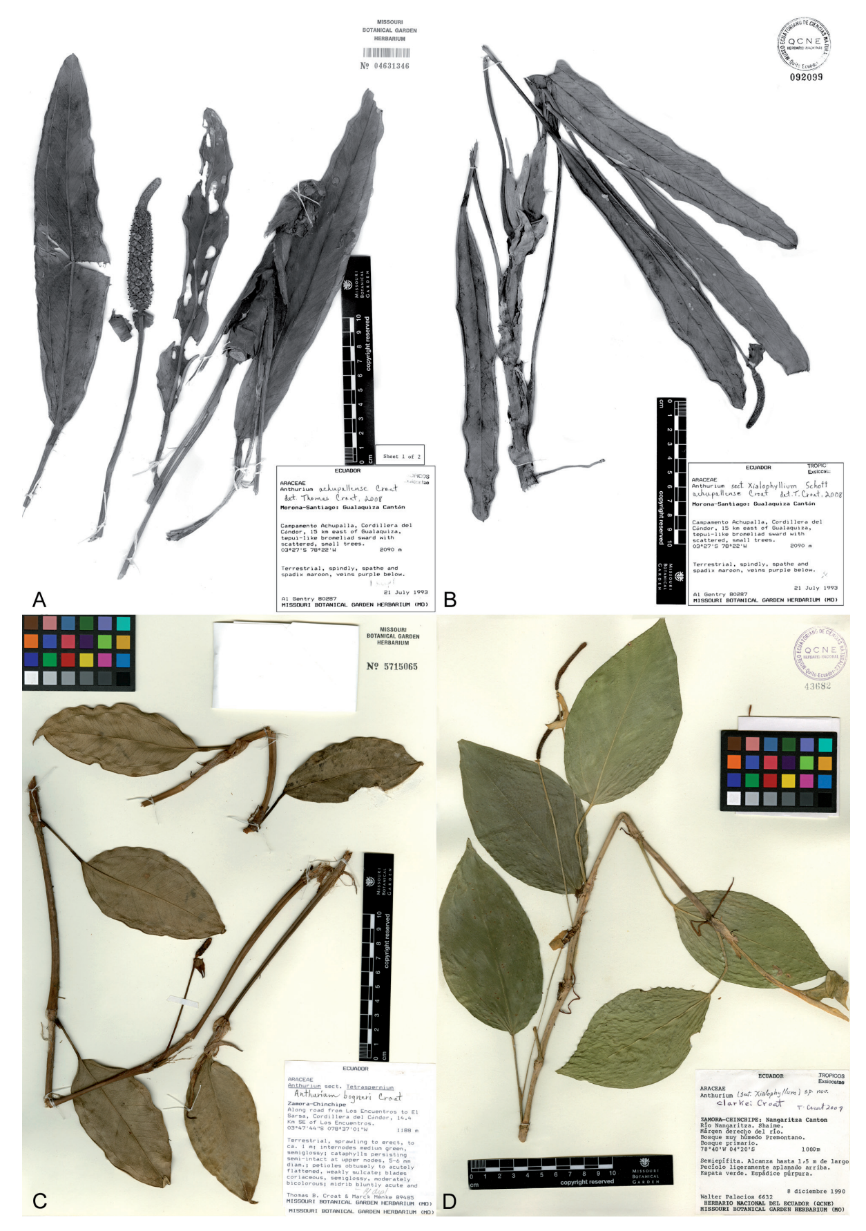
Fig. 1. A–B: Anthurium achupallense – holotype specimen at MO, Gentry 80287 (A), isotype specimen at QCNE (B); C: A. bogneri – holotype specimen at MO, Croat & Menke 89485; D: A. clarkei – isotype specimen at QCNE, Palacios 6632.