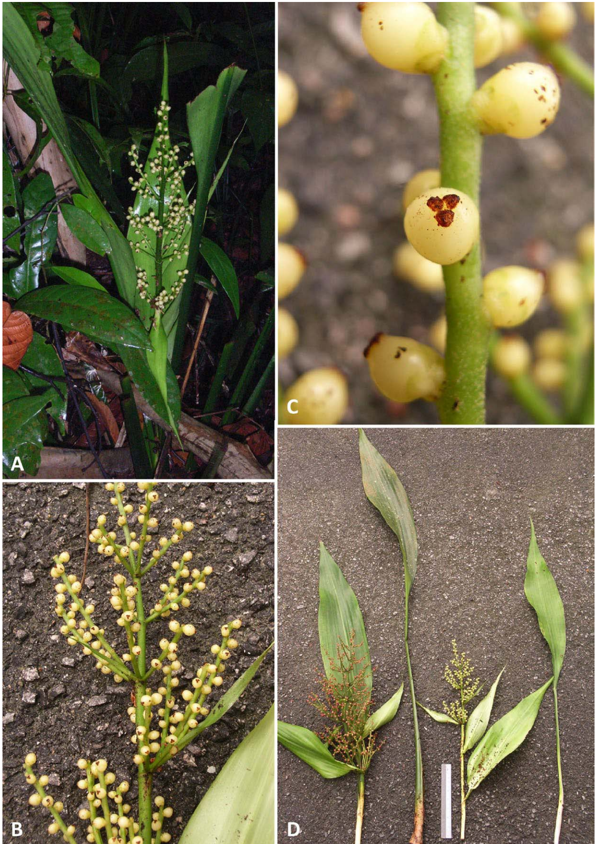
Fig. 1. Hanguana exultans – A: flowering plant in habitat; B: infructescence, note the rather sharply ascending branches; C: detail of the ventrally gibbose-ellipsoid fruits ripening pale yellow with a sessile stigma comprising 3 separate (not connate) orange brown lobes; D: median leaf and inflorescence of H. pantiensis (left) compared with H. exultans (right). – A–D: Siti Nurfazilah & al. HA-55; images © Rosazlina Bt Rusly.