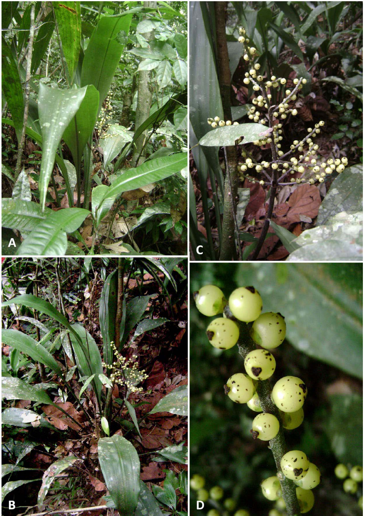
Fig. 5. Hanguana stenopoda – A–B: plants in habitat; B: detail of infructescence, note the partial inflorescences each with only 2 or rarely 3 branches and that the subtending bracts have fallen; D: ripe fruits with opaque tepals, briefly stipitate stigma, with the lobes connate, deep chocolate brown, and the fruit with conspicuous black speckles. – A–D: Siti Nurfaizilah & al. HA-60; images © Siti Nurfaizilah Bt Abdul Rahman.