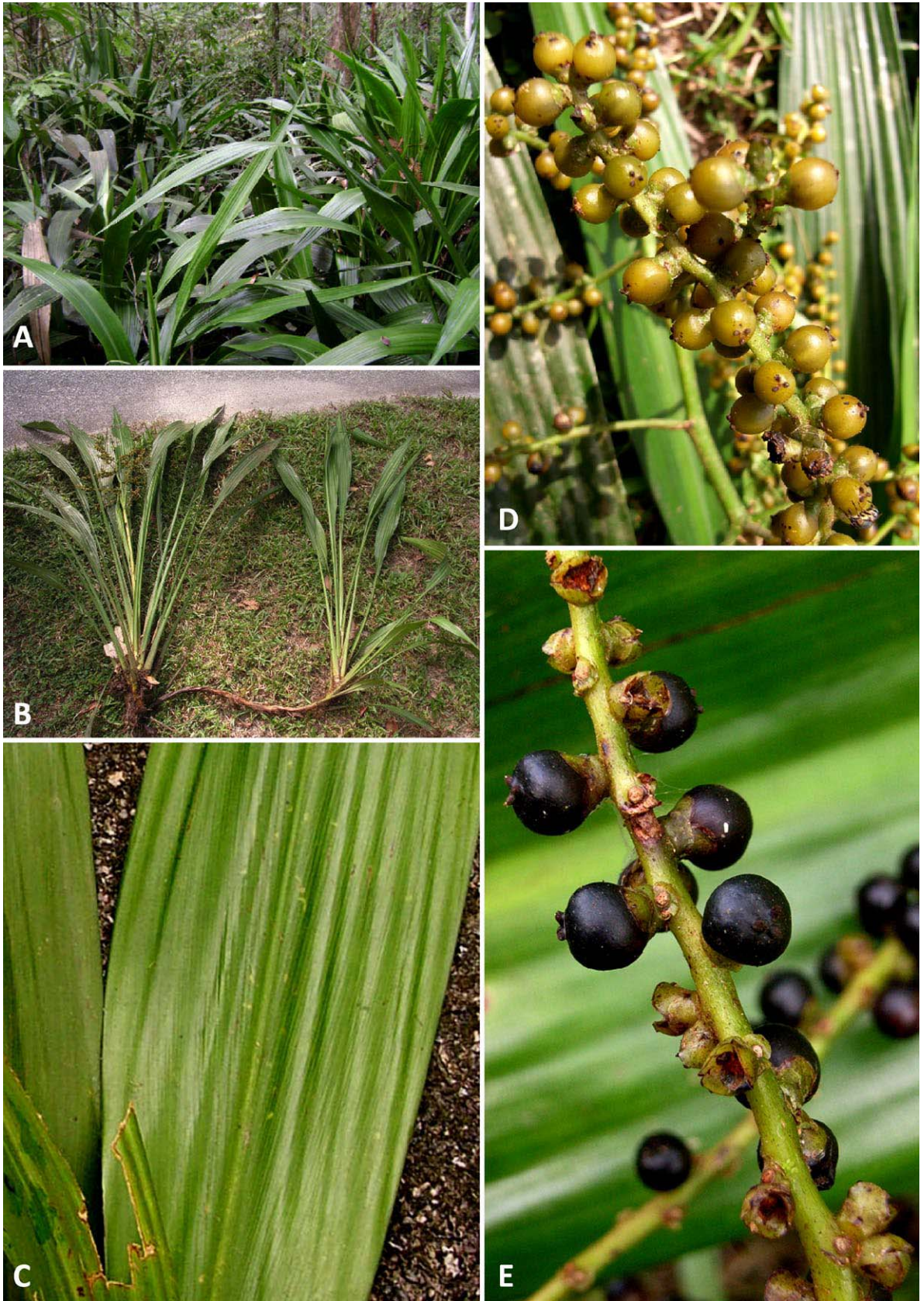
Fig. 2. Hanguana nitens – A: plants in habitat, note the arching (not stiffly erect) leaves; B: portion of a mature plant showing a stolon and the conspicuous, long ( \frac{2}{3} – \frac{1}{4} of the leaf length) pseudopetiole; C: plicate leaf blade; D: portion of an immature infructescence, compare the separate, erect, pointed stigma lobes with those of H. malayana (Fig. 7B); E: ripe fruits. – A–E: Siti Nurfazilah & al. HA-48; images © Rosazlina Bt Rusly.