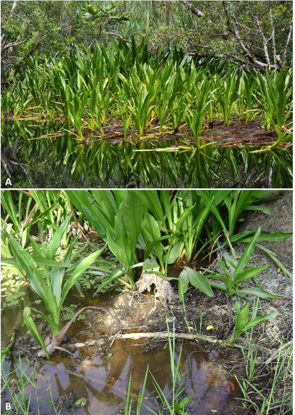
Fig. 6. Hanguana malayana – A: plants in habitat in Maludam N. P., Sarawak, note the stiffly erect leaves and the stolons floating on the water surface; B: detail of semi-terrestrial stolons in habitat, Perak. – A: image © Mike Lo; B: image © Siti Nurfazilah Bt Abdul Rahman.