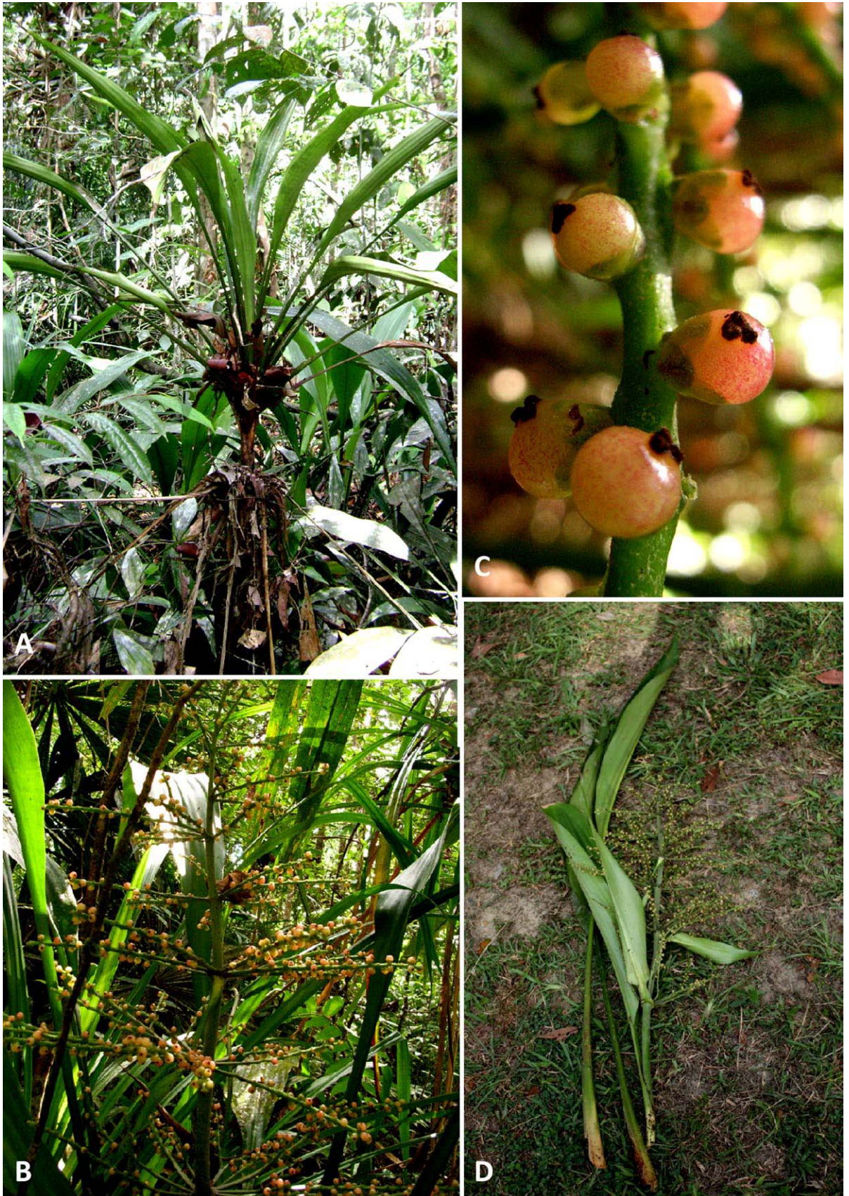
Fig. 4. Hanguana podzolicola – A: plant in habitat showing the tall, leafless stem produced by older plants; B: detail of infructescence, note the open nature of the panicle and the spreading branches of the partial inflorescences; C: ripe fruits, with the stigma obliquely to sublaterally inserted by longitudinally bending of ovary; D: median leaf and inflorescence. – A–D: Siti Nurfazilah & al. HA-49; images © Rosazlina Bt Rusly.