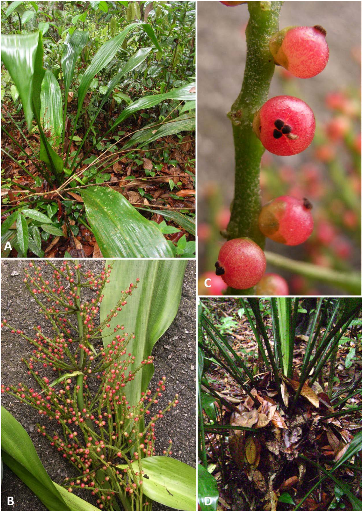
Fig. 3. Hanguana pantiensis – A: plant in habitat, note the dense panicle carried down in the leaves; B: detail of infructescence, note the dense panicle with branches of the partial inflorescences ascending; C: ripe fruits, with the stigma obliquely to sublaterally inserted by longitudinally bending of ovary; D: leaf bases showing litter-trapping. – A–D: Siti Nurfaizlah & al. HA-56; images © Rosazlina Bt Rusly.