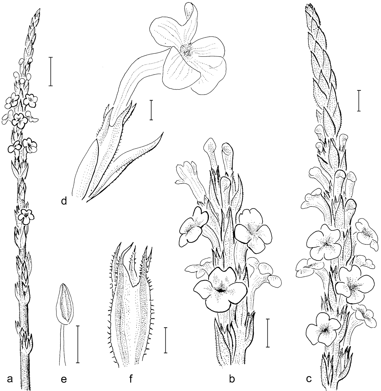
Fig. 1. Striga barthlottii – a–c: inflorescence, habit and details; d: flower; e: stamen; f: calyx. – Scale bars: a = 1 cm, b–c = 5 mm, d–f = 1 mm; drawing by E. Fischer from the holotype.

(BM); Beni Mellal, Kesbeh, 800 m, sur Euphorbe cactiforme, 22.3.1983, Lewalle 10634 (BM, M); Beni Mellal, between Zaouia Ahanesal and Tilougguite near “Cathedral rock”, 1850 m, parasitic on Euphorbia gumifera [actually either E. officinarum subsp. echinus or E. resinifera ], 15.7.1973, Davis 55245 (BM, M); Grand Atlas, Bin-el-Ouisdane, Euphorbia resinifera , 750 m, 24.5.1927, E. Jahandiez 256b (M).