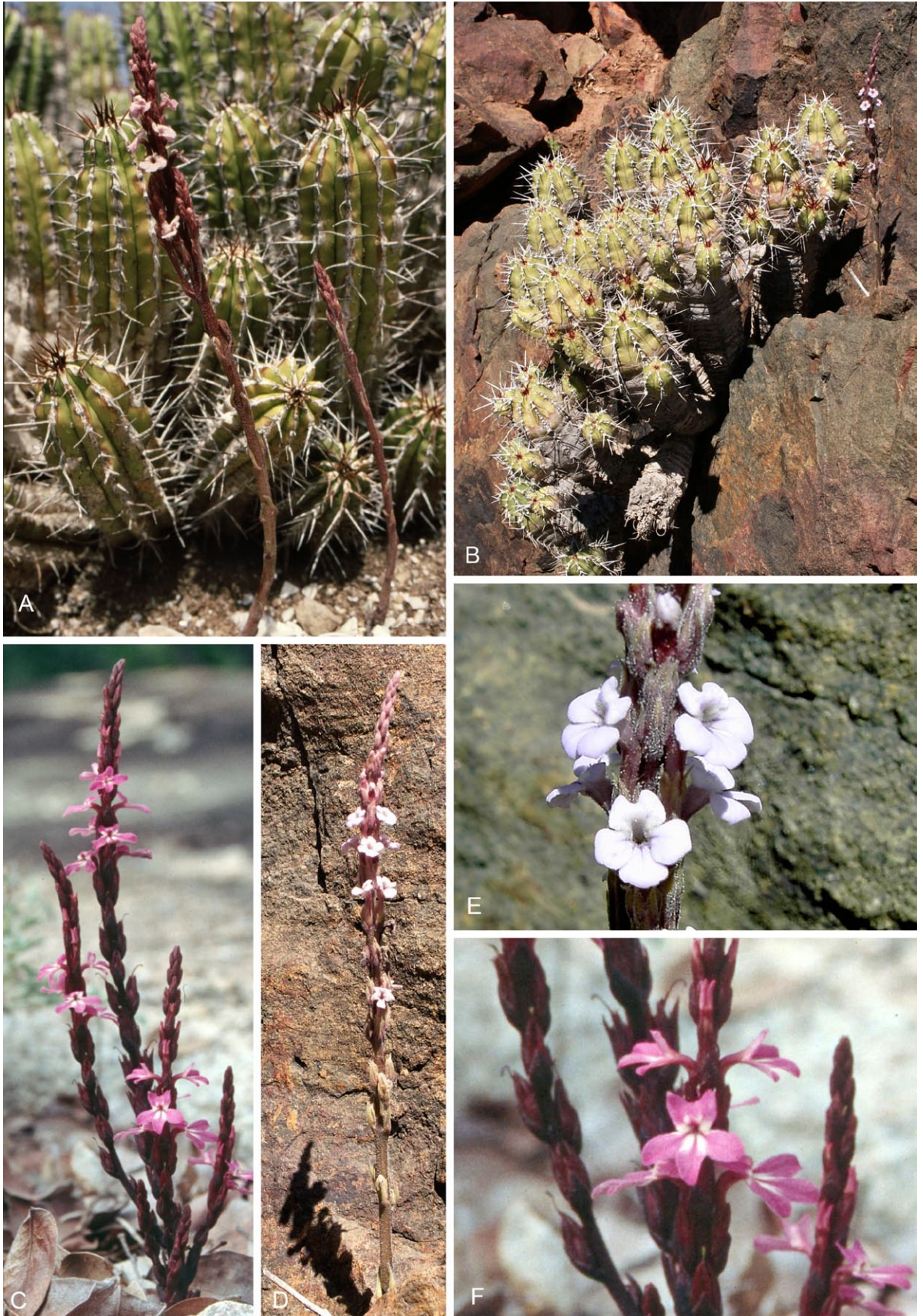
Fig. 2. A, B, D, E: Striga barthlottii , habit and habitat with its host Euphorbia officinarum subsp. echinus (A, B, D), corolla in detail (E); A from Cap Rhir, photograph April 2006 by W. Barthlott, B, D, E from Djebel Izmi N of Et Tnine, photographs 2.4.2005 by J. Mutke. – C + F: S. gesnerioides , habit (C) and corolla in detail (F), from Zimbabwe; photograph February 1994 by R. Seine.