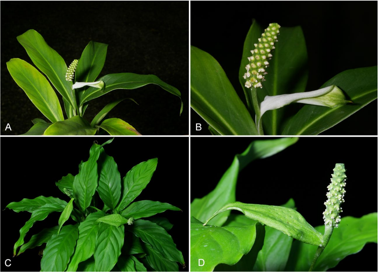
Fig. 1A–B. Spathiphyllum pygmaeum – whole plant (A); inflorescence (B), note the white spathe with a green apex and recurved margins. – C–D: S. minor – whole plant (C); inflorescence (D), note the completely green spathe. – A–B from the plant cultivated in the Botanical Garden Munich of which the holotype was preserved, C–D from Bogner 2978 , Botanical Garden Munich. – All photographs by Günter Gerlach.

slightly thinner, third order veins very thin and inconspicuous. Inflorescence shorter than the leaves; peduncle c. 8 cm long and c. 1.8 mm in diam., terete, green, mostly enclosed by the sheath of the preceding leaf and projecting for only c. 1 cm beyond; spathe narrowly elliptic, c. 3 cm long and 0.9 cm wide, pure white on both sides but midvein light green, base decurrent, apex c. 0.8 cm long, green, margin of spathe recurved; stipe of spadix c. 1 cm long and 1.2 mm in diam., green; spadix subcylindric to slightly conoid (narrowing towards apex), c. 2 cm long and to c. 0.5 cm in diam. Flowers bisexual, c. 1.8 mm in diam.; tepals 6, truncate, c. 1.5 mm long, upper part green and 0.8 mm wide, lower part white; gynoeceium c. 2 mm long, ovary obovoid, 1.4–1.5 mm long, in upper part 1.3–1.4 mm in diam., at base c. 0.9 mm in diam., 2-locular; ovules anatropous, 1 ovule in each locule, c. 0.5 mm long; style conoid, white, c. 0.5 mm long, exserted from the tepals, stigma small, disk-like, c. 0.4 mm in diam., whitish when fresh, becoming brownish; tissue of gynoeceium with many trichoslereids; stamens 6, filament flat, 1–1.1 mm long 0.7–0.8 mm wide, shorter than the tepals during the female stage, elongated to about 1.5 mm length at maturity (in the male stage),