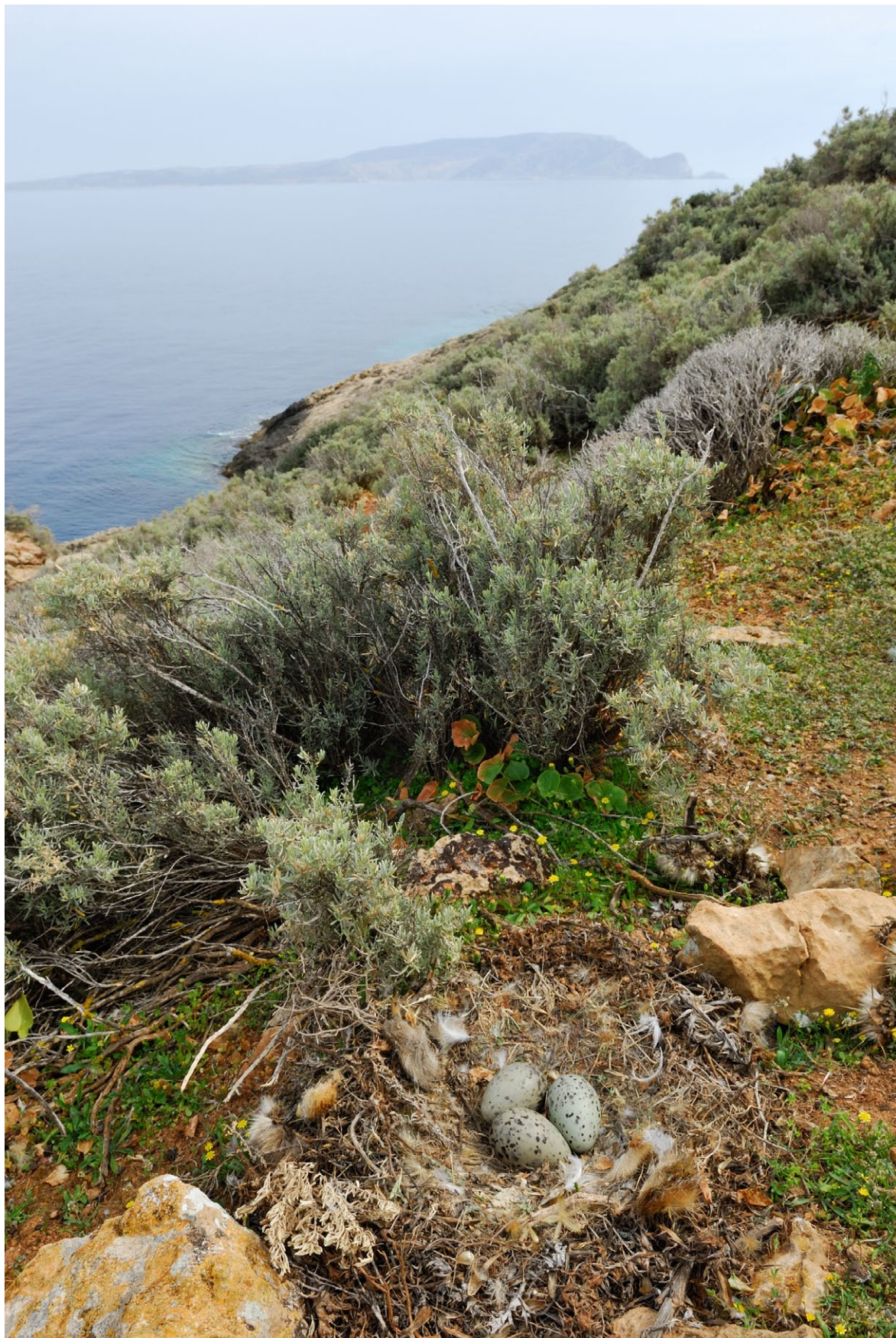
Fig. 3. Halo-nitrophytic scrub with Atriplex mollis on Gavdopoula in its single European locality, with gull's nest ( Larus michahellis michahellis ). April 2009.