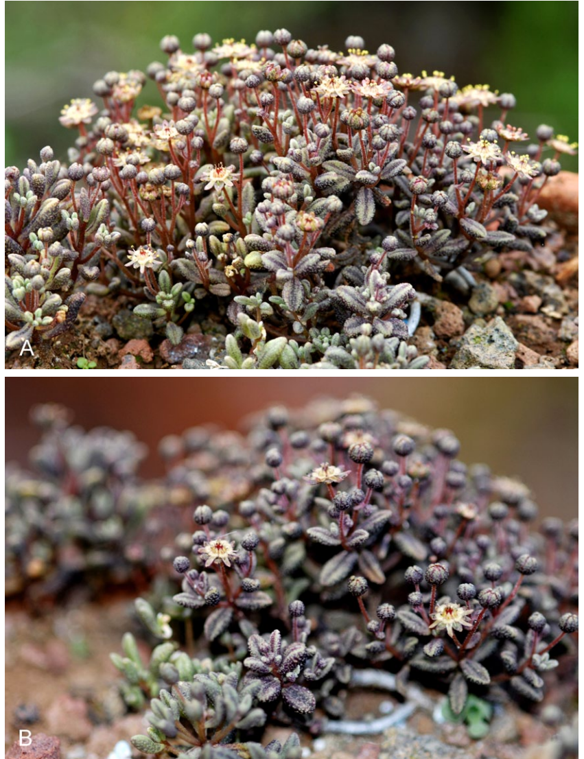
Fig. 3. A–B: an individual of Monanthes subrosulata at the type locality (Spain, La Palma, “Canal de Tegalate”, 425 m) on 1 Apr 2006.

References on the chorology of the species of Monanthes in La Palma (Santos 1983; Nyffeler 1992; Bañares 2008) and a recent survey in the field revealed two sites with co-occurring taxa (showing a close connection among individuals): (1) M. laxiflora – M. polyphylla subsp. amydros in the central part of La Palma at La Es-