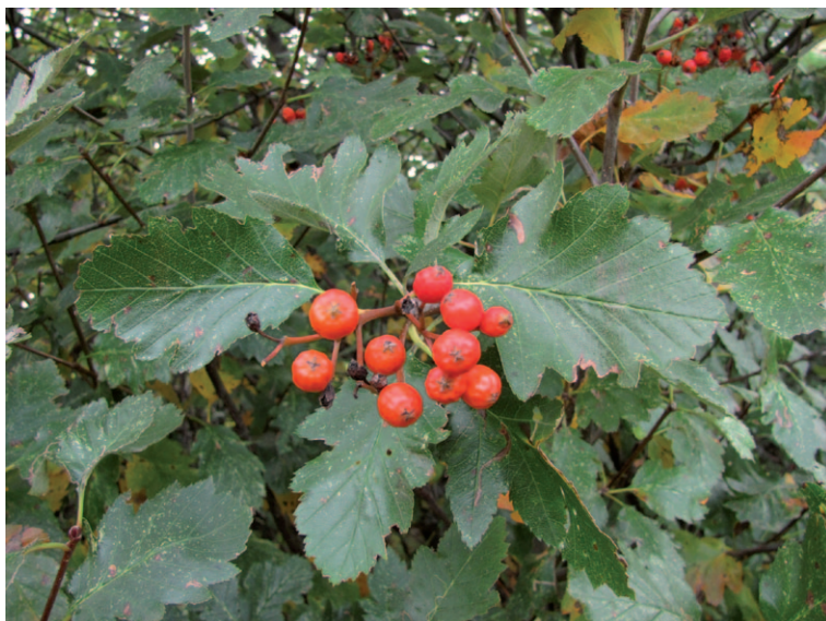
Fig. 5. Sorbus tauricola , fruiting branch showing the glossy upper side of the leaves. – Crimea, Ai-Petri Mt, 25 Sep 2010.

The Crimean whitebeams that belong to the apomictic complex of Sorbus latifolia (Lam.) Pers. s.l. were first discovered by Zelenetzky (1906), who identified them as “ S. scandica Fries”. Stankov (1927) reported the plant as S. latifolia . Popov (1959a) acknowledged the isolated occurrence of the Crimean plants and their difference from Central European whitebeams and described the Crimean populations as S. pseudolatifolia K. Popov. Popov provided an extensive description in Latin but designated two gatherings as types, one in flower and the other in fruit, making the new name not validly published under Art. 40.1. Zaikonnikova (1985) renamed the species because of homonymy but omitted the type designation, and this issue was also neglected in a recent list of Ukrainian type specimens (Fedoronchuk 2006). The name suggested by Zaikonnikova is in current use (Czerepanov 1995; Mosyakin & Fedoronchuk 1999; Zaikonnikova 2001; Yena 2012) and is validly published here. Under Art. 46.5 and 46.10 its authorship is “Zaik.