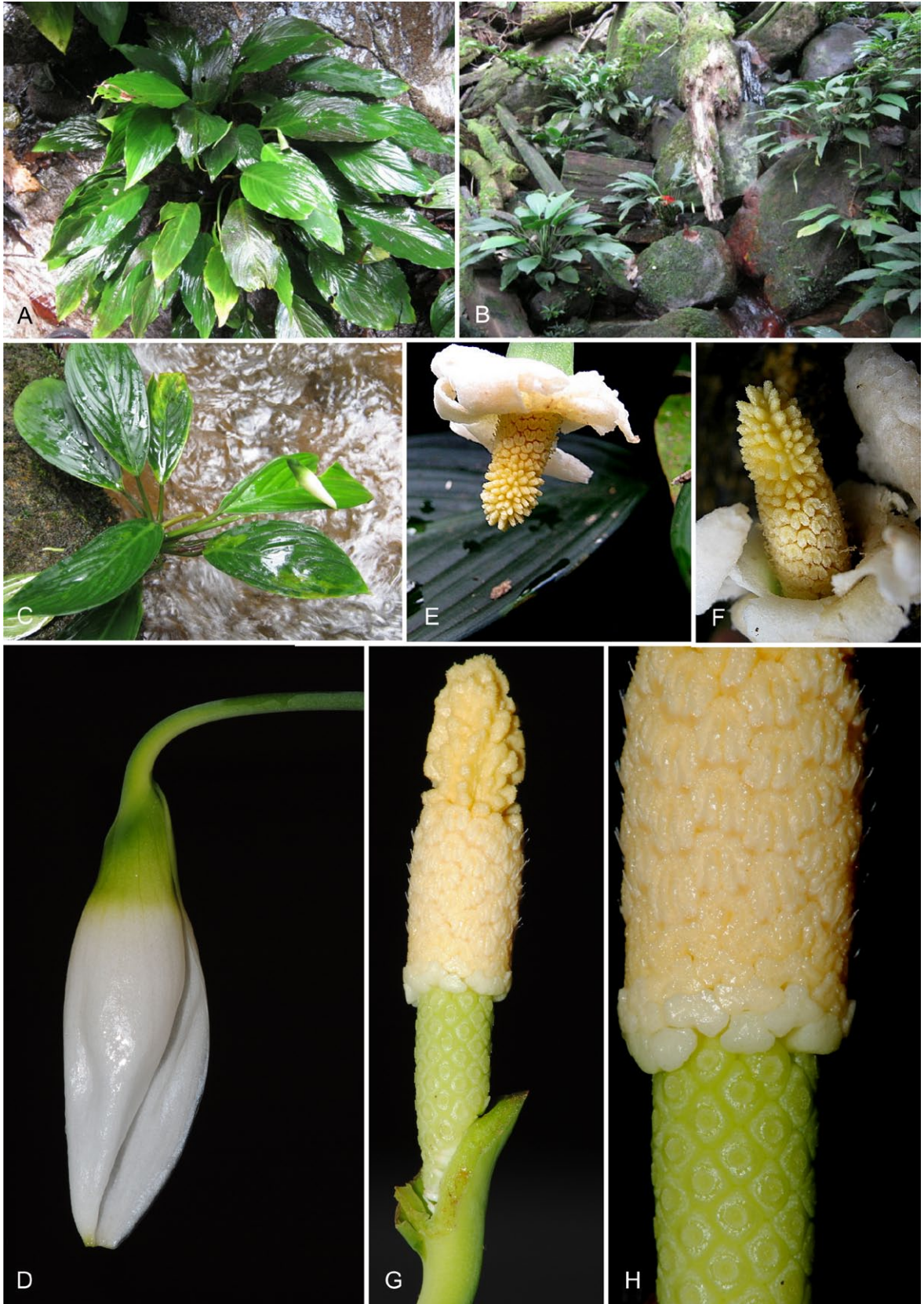
Fig. 2. Aridarum rostratum – A–C: plants in habitat; note the pendent inflorescences visible (B, centre and mid right); D: inflorescence at early pistillate anthesis; E & F: inflorescence at staminate anthesis; note that with the majority of the spathe limb is already shed; G: spadix (spathe artificially removed) at onset of staminate anthesis; H: detail of spadix fertile zones at onset of staminate anthesis; note that the interpistillar staminodes are beginning to expand laterally. – Photograph A from K. Nakamoto AR-3538 ; B–H from K. Nakamoto AR-3532 ; A–F by K. Nakamoto ; G and H by P. C. Boyce .