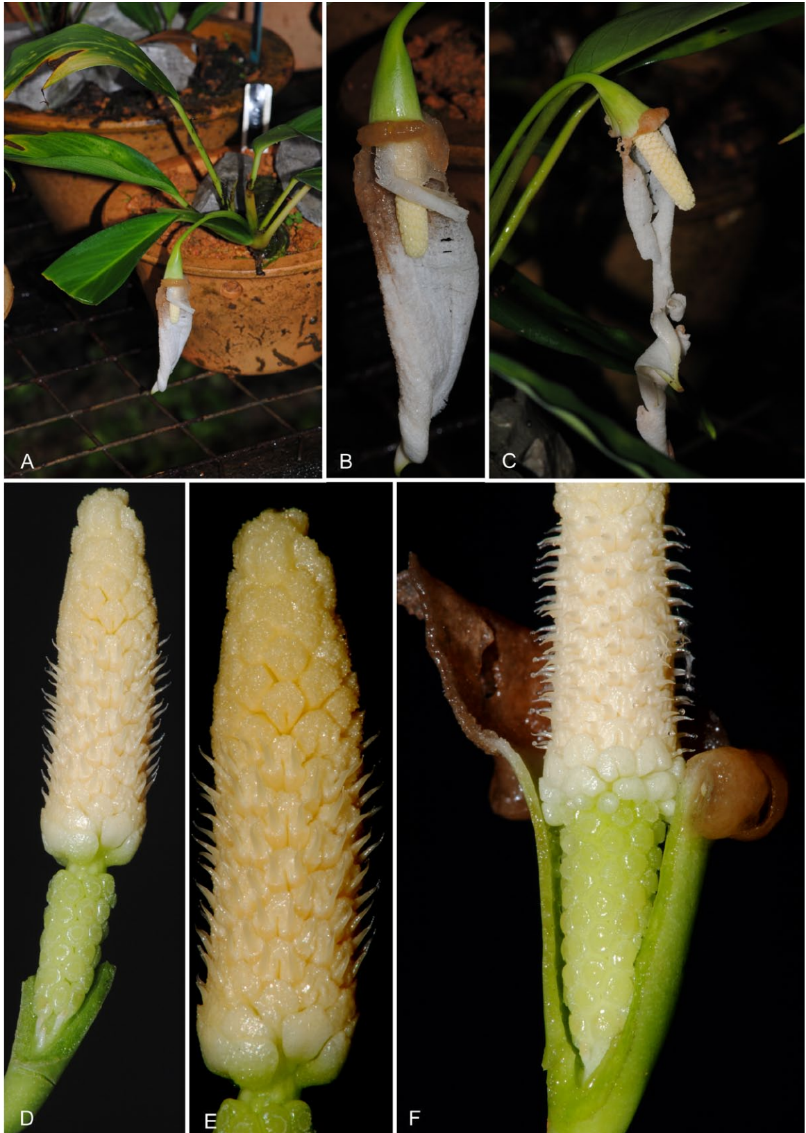
Fig. 3. Aridarum uncum – A: cultivated plant with inflorescence at staminate anthesis; note the pendent inflorescence, and the disintegrating spathe limb; B & C: inflorescence at staminate anthesis; D: spadix (spathe artificially removed) at end of pistillate anthesis; note that the interpistillar staminodes have yet to expand, and that the thecae horns are directed upwards; E: detail of appendix, staminate zone, and interstice staminodes; F: inflorescence at late staminate anthesis, with the lower spathe artificially removed; note the deliquescent remnants of the spathe limb, that the thecae horns have reflexed, many with a droplet at the tip, and that the interstice staminodes have expanded laterally. – Photographs from K. Nakamoto AR-3901 , A–F by P. C. Boyce.