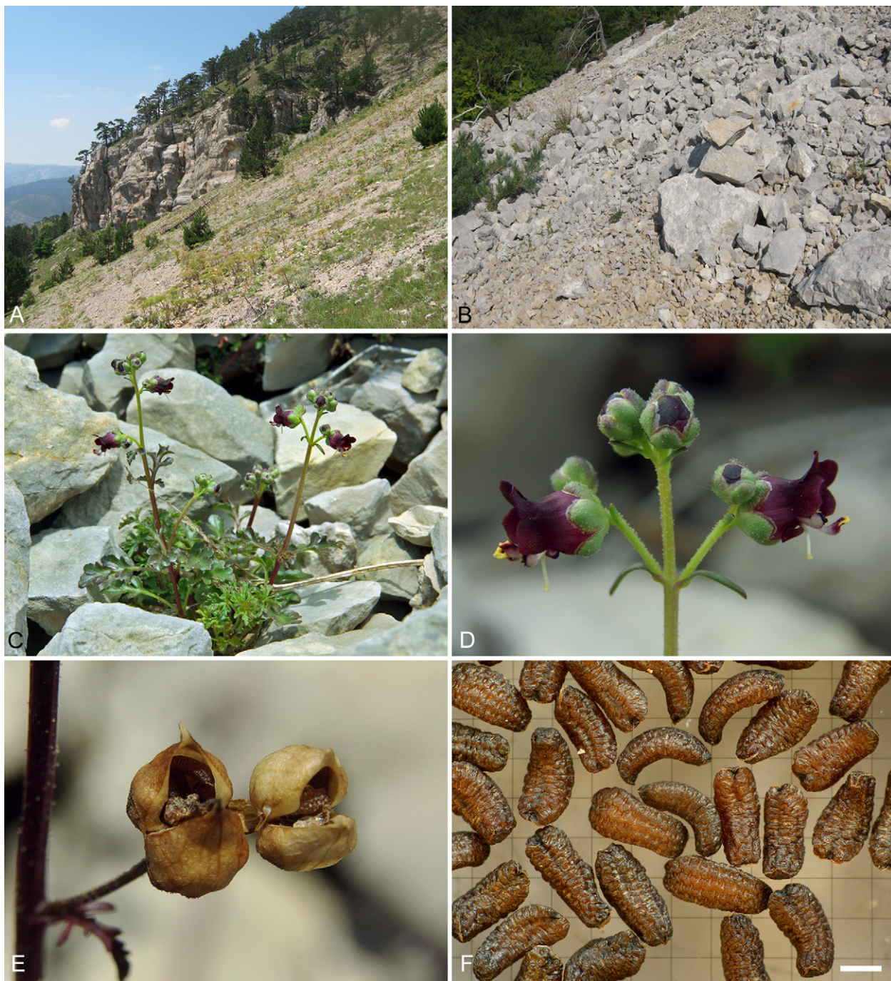
Fig. 1. Scrophularia exilis and its habitats – A: habitat at Djunyn-Kosh; B: habitat at Shagan-Kaya (mobile part of the scree); C: general aspect of a flowering plant; D: flowers and buds; E: capsules; F: seeds. – Scale bar = 1 mm. – Photographs by A. Fateryga (A), A. Nikiforov (B) and S. Svirin (C–F).

In 2012, we were successful in rediscovering Scrophularia exilis in its type locality, as well as in a second locality, and in collecting new material for the first time since the collection of the type specimens in 1929. The purpose of this paper is to give the diagnostic characters of S. exilis according to our new data, to establish its differences from S. heterophylla subsp. laciniata , to ascertain coenotic conformity of the species and to provide an updated key to the species of Scrophularia in the Crimean flora.