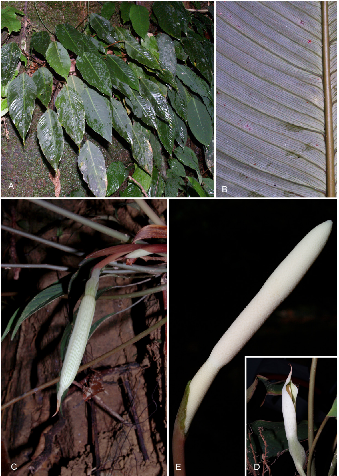
Fig. 2. Schismatoglottis mayoana – A: plants in habitat, edge of sandstone waterfall, Kubah N. P.; B: detail of abaxial surface of leaf blade, showing dense pellucid secondary venation; C: plant flowering (very early pistillate anthesis) in habitat. Note matt reddish-suffused peduncle and white spathe limb; D: inflorescence at late pistillate anthesis. Note that in mature inflorescence would be pendent; E: spadix at late pistillate anthesis, with spathe artificially removed. Note that top of pistillate zone is markedly narrower than other zones of spadix. – All from P. C. Boyce & S. Y. Wong AR-1828. – Photographs by Peter C. Boyce.