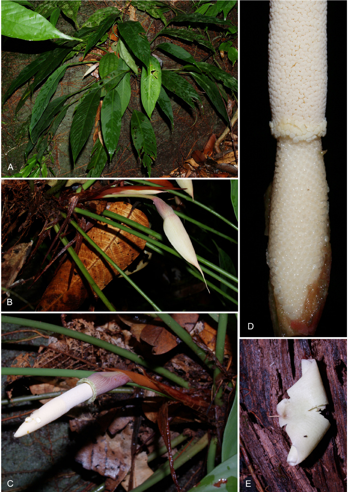
Fig. 3. Schismatoglottis nicolsonii – A: plants in habitat, edge of sandstone waterfall, Bako N. P.; B: flowering plant in habitat; C: inflorescence at onset of staminate anthesis, with spathe limb shed; D: detail of pistillate zone and lower part of staminate zone. Note that staminate zone is fertile to base; E: spathe limb shed during onset of staminate anthesis. – All from P. C. Boyce & al. AR-2106. – Photographs by Peter C. Boyce.