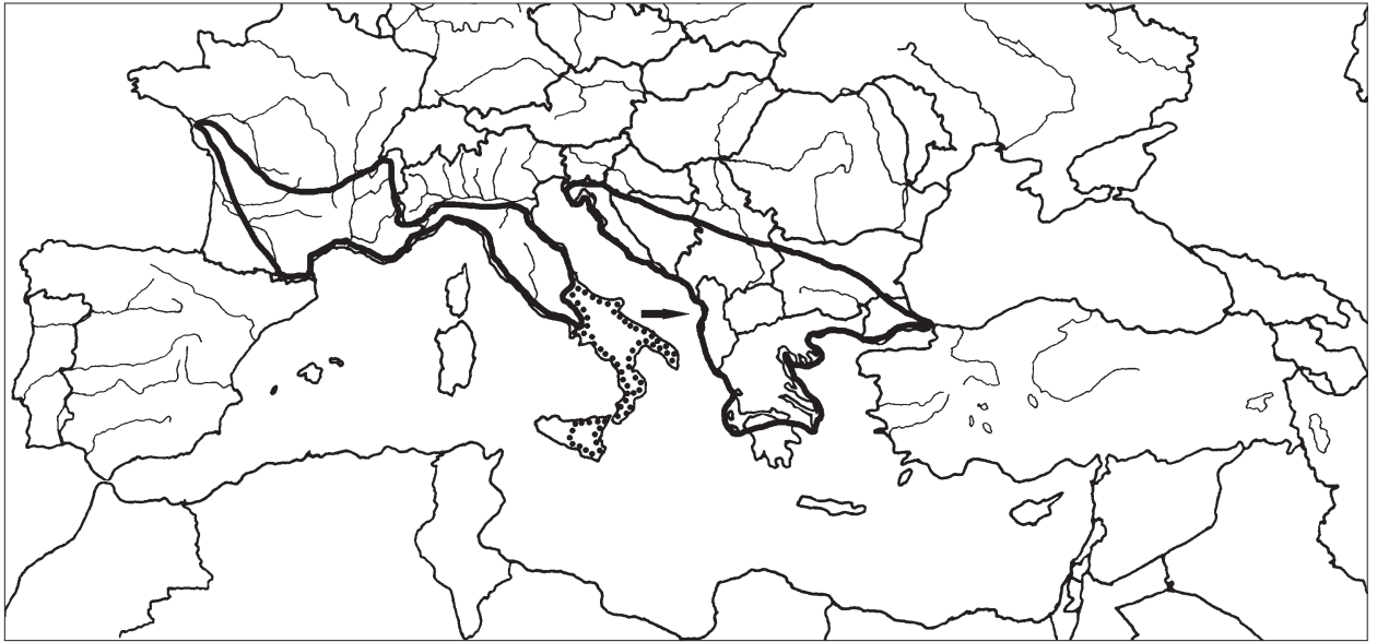
Fig. 5. Distribution of Sedum ochroleucum subsp. ochroleucum (solid line) and S. ochroleucum subsp. mediterraneum (dotted line). The arrow indicates a possible migration route via a former land bridge between Italy and the Balkan Peninsula.