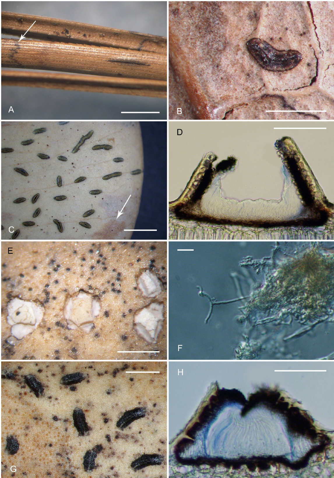
Fig. 2. A: Lophodermium australe , ascocarp on needle of Pinus (scale bar = 1 mm), arrow indicates black zone line; B: Lophodermium mangiferae , curved ascocarp on leaf of Mangifera indica (scale bar = 1 mm); C, D: Lophodermium platyplacum , C: ascocarps on leaf of Clusia rosea (scale bar = 3 mm), arrow indicates diffuse reddish zone, D: ascocarp in vertical section (scale bar = 100 \mu m); E, F: Marthamyces quadrifidus , E: open ascocarps on leaf of Clusia rosea (scale bar = 1 mm), F: paraphysis branched near apex (scale bar = 25 \mu m); G, H: Terriera minor , G: ascocarps on leaf of Clusia rosea (scale bar = 1 mm), H: ascocarp in vertical section (scale bar = 100 \mu m).