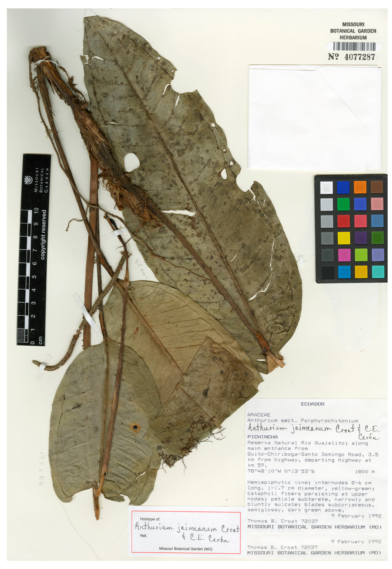
Fig. 1. Anthurium jaimeanum - holotype specimen (MO 4077287).