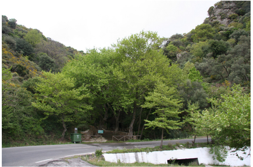
Fig. 3. A riparian plane forest in a small ravine in an area with maquis on the W slope of the westernmost mountains of Kriti (loc. 28). It is a typical representative of riparian plane forests in small ravines in the sense that it is partly modified by picnic amenities at the intersection of the road.

35. Nomos Rethymnis, N foothills of Mt Psiloritis, c. 7 km SW of Perama town, c. 2 km NE of Arkadi monastery,