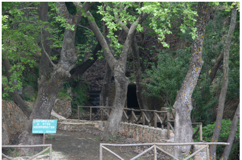
Fig. 4. Closer view of loc. 28. Note the light and dark patches on the tree trunks, representing the Xanthorion and hygrophytic elements of the flora, respectively.

at Agia Paraskevi chapel, 35°19'N, 24°39'E, 380 m. – Riparian Platanus forest on N-facing slope, inclination 20°, with phrygana/maquis. Substrate limestone. On Platanus trees c. 50 cm d.b.h. – 5 Apr 2011.