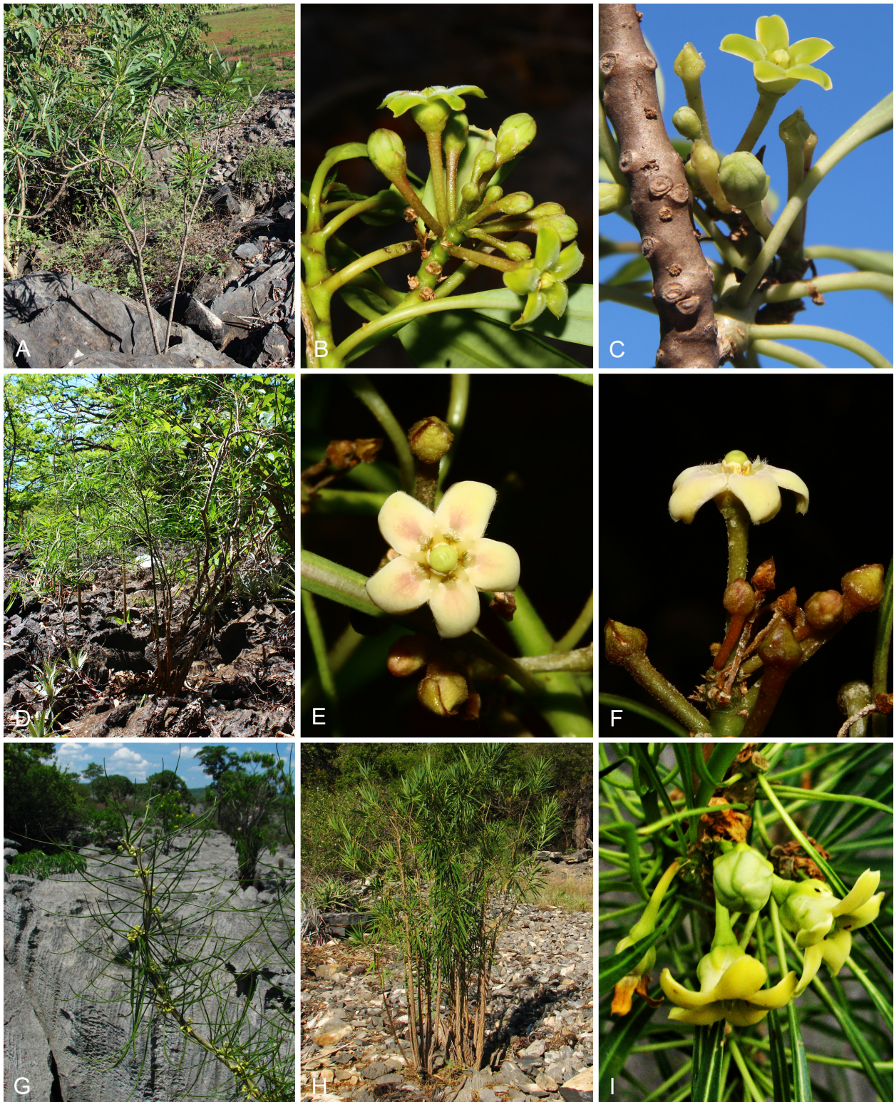
Fig. 2. Marsdenia calcaria : A: habit; B, C: inflorescence with buds and open flowers, lateral view. – Marsdenia phallica : D: habit; E: flower, apical view; F: flower, lateral view. – Marsdenia breviramosa : G: branch with leaves and inflorescences. – Marsdenia zehntneri : H: habit; I: inflorescence with buds and open flowers, lateral view.