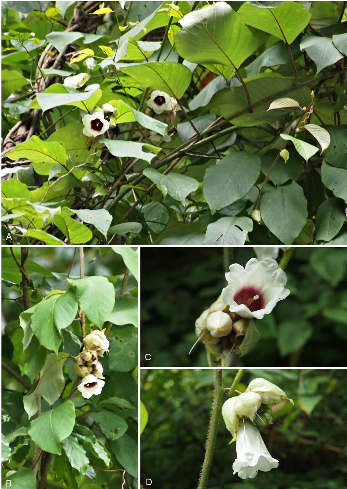
Fig. 2. Argyreia decemloba inflorescence and corolla details – A, B: plant habit (voucher: Fujikawa & al. 95008); C: flower in frontal view, showing 10-lobed corolla limb, included genitalia, and reddish interior of corolla tube; D: inflorescence and flower in lateral view, showing capitate inflorescence with short, thick peduncle, overlapping whitish bracts, and triangular-funnelform corolla shape (voucher: Fujikawa & al. 94296).