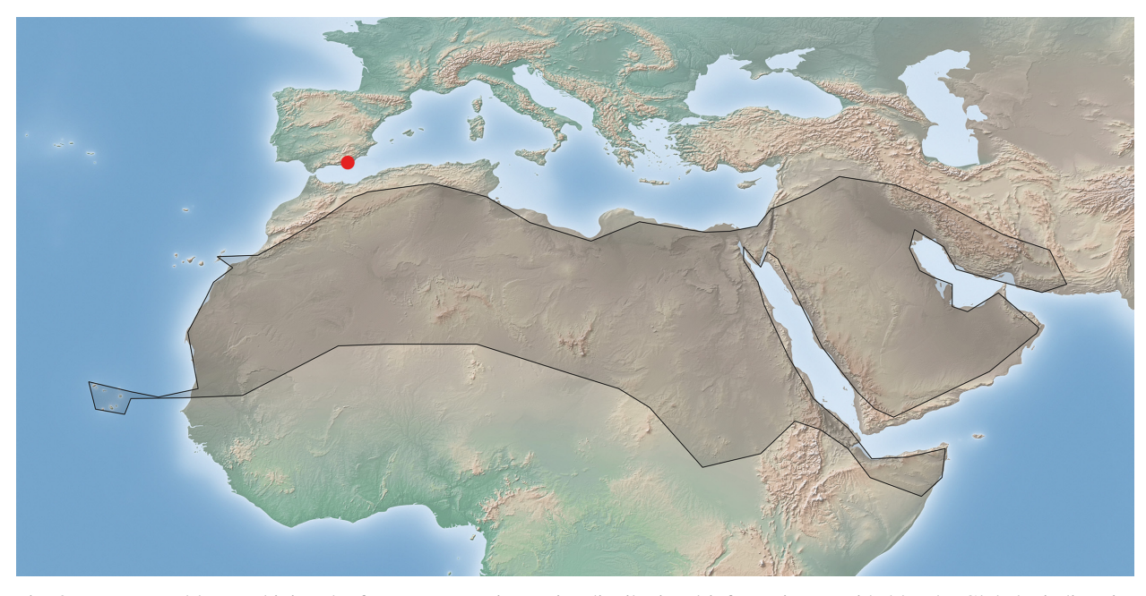
Fig. 3. Map created by combining the fragmentary or imprecise distributional information provided by the Global Biodiversity Information Facility (https://www.gbif.org/) and the Catalogue of Life (https://www.catalogueoflife.org/) with the general map in Jia & al. (2016). The red dot indicates the Spanish localities presented here.

Iran (Fig. 3), and now must be added to the list of genera and species distributed mainly if not only in the Saharo-Arabian region and with their only European populations in the arid areas of southeastern Spain: Ammochloa palaestina Boiss., Anabasis articulata (Forssk.) Moq., Commicarpus plumbagineus (Cav.) Standl., Enneapogon persicus Boiss., Forsskaolea tenacissima , Hammada ar ticulata (Moq.) O. Bolòs & Vigo, Ifloga spicata (Forssk.) Sch. Bip., Koelpinia linearis Pallas, Leysera leyseroides (Desf.) Maire and Notoceras bicorne .