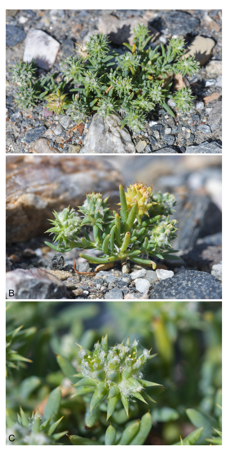
Fig. 1. Gymnocarpos sclerocephalus – A, B: two individuals found in the rambla of Lanujar; note the heterogeneous, stony nature of the soil; C: close-up of the inflorescence; note the tightly clustered flowers, spiny bracts and sepals, and white hairs covering the sepals. – A–C: Spain, Almería, 17 Mar 2018, photographed by F. Le Driant.

dispersal by epizoochory (Bittrich 1993: 214), explaining the particularly large geographical range of the species compared to other members of the genus and making still