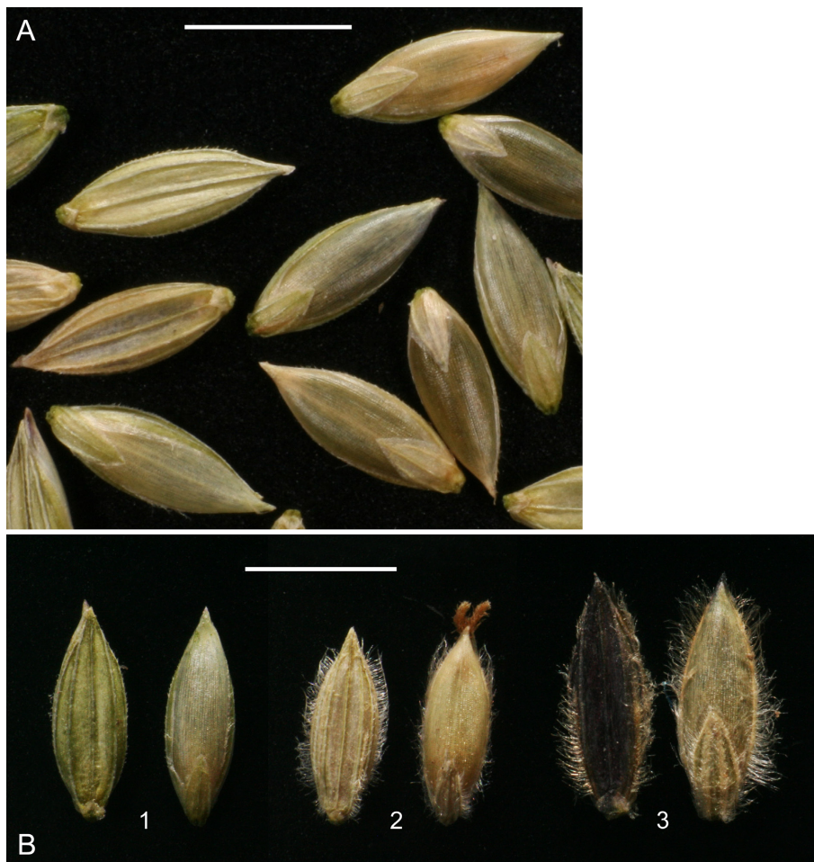
Fig. 3. A: spikelets of Digitaria aegyptiaca subsp. aegyptiaca ; B: comparison of spikelets of D. aegyptiaca subsp. aegyptiaca (1), D. sanguinalis var. parvispicula (2); and D. sanguinalis var. sanguinalis (3). – Scale bars: A, B = 2 mm. – Source of material: Spain, Santiago de Compostela (A, B1); Germany, Bamberg (B2, B3).