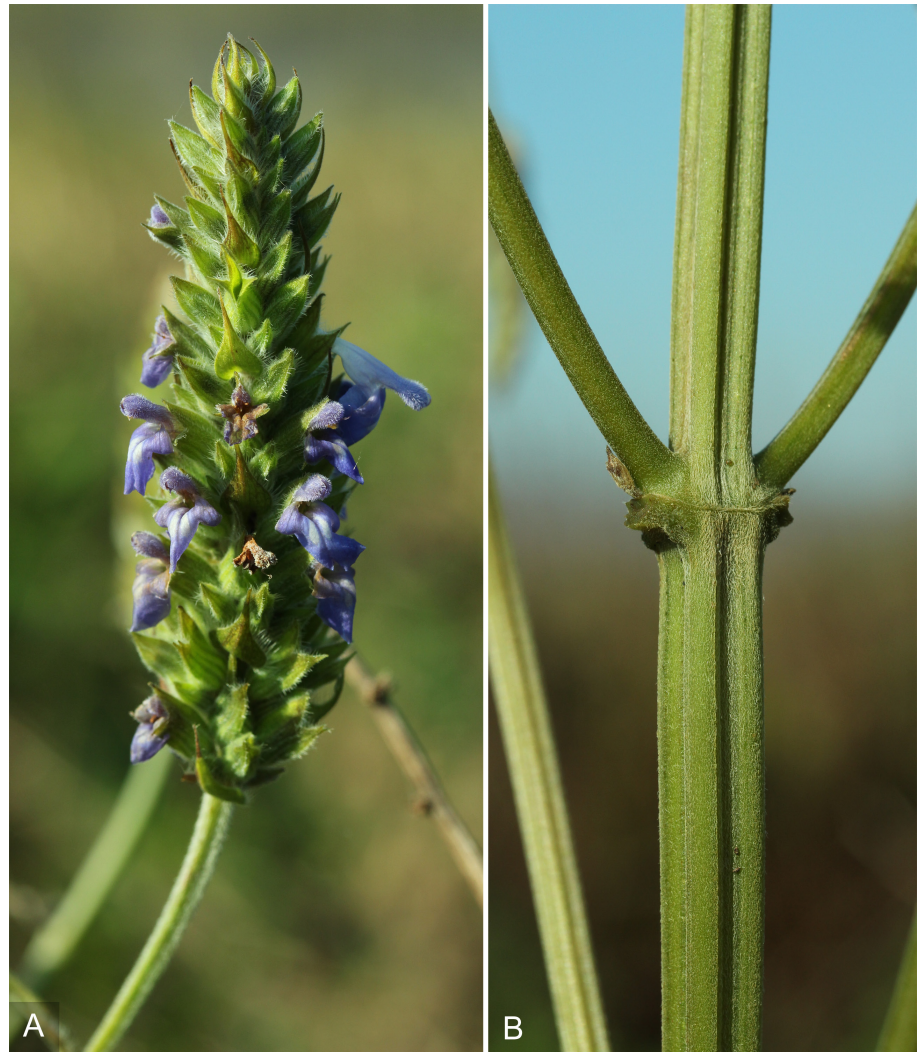
Fig. 4. Salvia hispanica – A: detail of inflorescence and bluish corollas, lower lip typically marked with two oval, white spots; B: detail of upper stem with regularly distributed, short, silvery and appressed hairs. – Bulgaria, Blagoevgrad district, Damyanitsa village, 15 Nov 2020, Kunev (SO 108057; SOM 177320), photographs by G. Kunev.