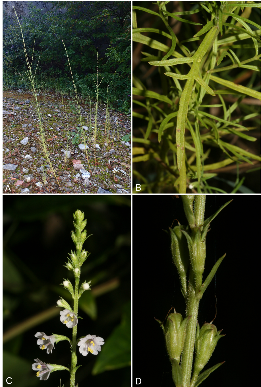
Fig. 5. Leptorhabdos parviflora – A: habit of flowering plants; B: lower stem leaves; C: inflorescence apex with c. 6 mm long flowers; note glands on calyx, peduncles and inflorescence rachis; D: fruits. – Italy, Trentino, Adige Valley, Trento, near Sardagna village, 15 Sep 2020, photographs by F. Prosser.

agna village, 46°03'31.24"N, 11°06'01.51"E, 565 m, disturbed arid terrain, scrub edge, limestone, 13 Sep 2020, Prosser (ROV74211, B). – On 17 April 1994 near the former Sardagna quarry near Trento I noted remains of dried plants from the previous year belonging to an unknown annual Orobanchaceae . Unfortunately, the importance of the find was underestimated and forgotten. Only on 13 September 2020 did I accidentally return to that place in the late season, finding a population of a couple of hundred individuals of an annual plant in flower and beginning to fruit: plants to 1.8 m tall; branching fastigiate; leaves opposite, lower stem leaves pinnate, other leaves linear; flowers numerous, yellowish, small, campanulate, in long spikes (Fig. 5). The classification with the key of the Flora of China Scrophulariaceae (Hong & al. 1998) led to Leptorhabdos parviflora . Two days later, a further eight populations were found within the neighbouring abandoned quarry consisting of another 800 individuals. All populations are included in an area of c. 5 ha. Subsequent searches nearby have given negative results so far. Leptorhabdos Schrenk is a monospecific genus today included in Orobanchaceae (Angiosperm Phylogeny Group 2016), tribe