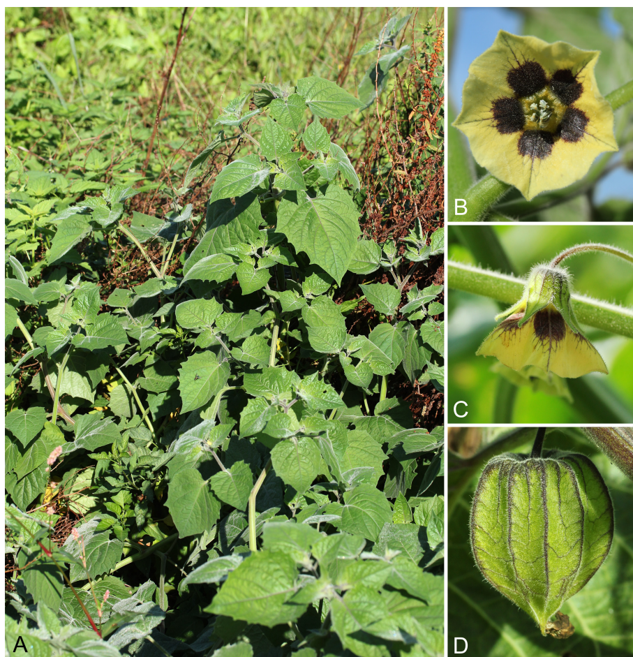
Fig. 7. Physalis peruviana – A: whole plants; B, C: anterior and lateral view of flower from upper part of stem, showing characteristic vinaceous-coloured spots, bluish anthers and patent, villous calyx indumentum; D: unripe fruit from upper part of stem. – Bulgaria, Blagoevgrad district, Damyanitsa village, 11 Oct 2020, Kunev (SO 108058; SOM 177319).

by reference to S. pusilla , because a diagnosis was provided (Turland & al. 2018: Art. 6.11, 6.12). Therefore, it could be treated as either a replacement name based on S. pusilla or the name of a new taxon (Turland & al. 2018: Art. 6.13). In the latter case, the new combination T. boryana would be not superfluous. However, it is accepted that the name G. boryanum was published as a replacement name (IPNI 2021). This is reasonable, supposing that Walpers examined the plate of S. pusilla (either in Bory de Saint-Vincent 1835–1836: t. 15, fig. 1 or in Chaubard & Bory de Saint-Vincent 1838: t. 16, fig. 1) and found that the illustrated plant, in his opinion, was indeed a Galium species. In fact, in the protologue of G. boryanum , Walpers (1843: 454) cited a plate that is original material for S. pusilla . In addition, Walpers certainly knew of the existence of the Linnaean G. pusillum and it can be assumed that for this reason he decided to refrain from the epithet pusillum . According to this interpretation, the name T. boryana is homotypic with S. pusilla and nomenclaturally superfluous, albeit not illegitimate because it has a basionym (Turland & al. 2018: Art. 52.1, 52.4); the correct combination in Thliphthisa is proposed here. The taxon is endemic to the mountains