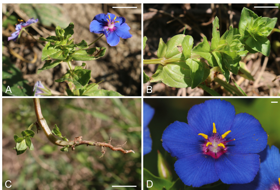
Fig. 6. Lysimachia arvensis subsp. platyphylla – A: general view of inflorescence; B: detail of stem with leaves; C: root detail; D: flower detail. – Scale bars: A–C = 1 cm; D = 1 mm. – A–C: Algeria, Boumerdes, Reghaïa lake, 24 Feb 2020; D: Algeria, El Tarf, Douar Guergour, 29 Apr 2016, photographs by E. Véla.

In conclusion, Lysimachia arvensis subsp. platyphylla represents a discrete taxon, with its subspecific rank awaiting kary-