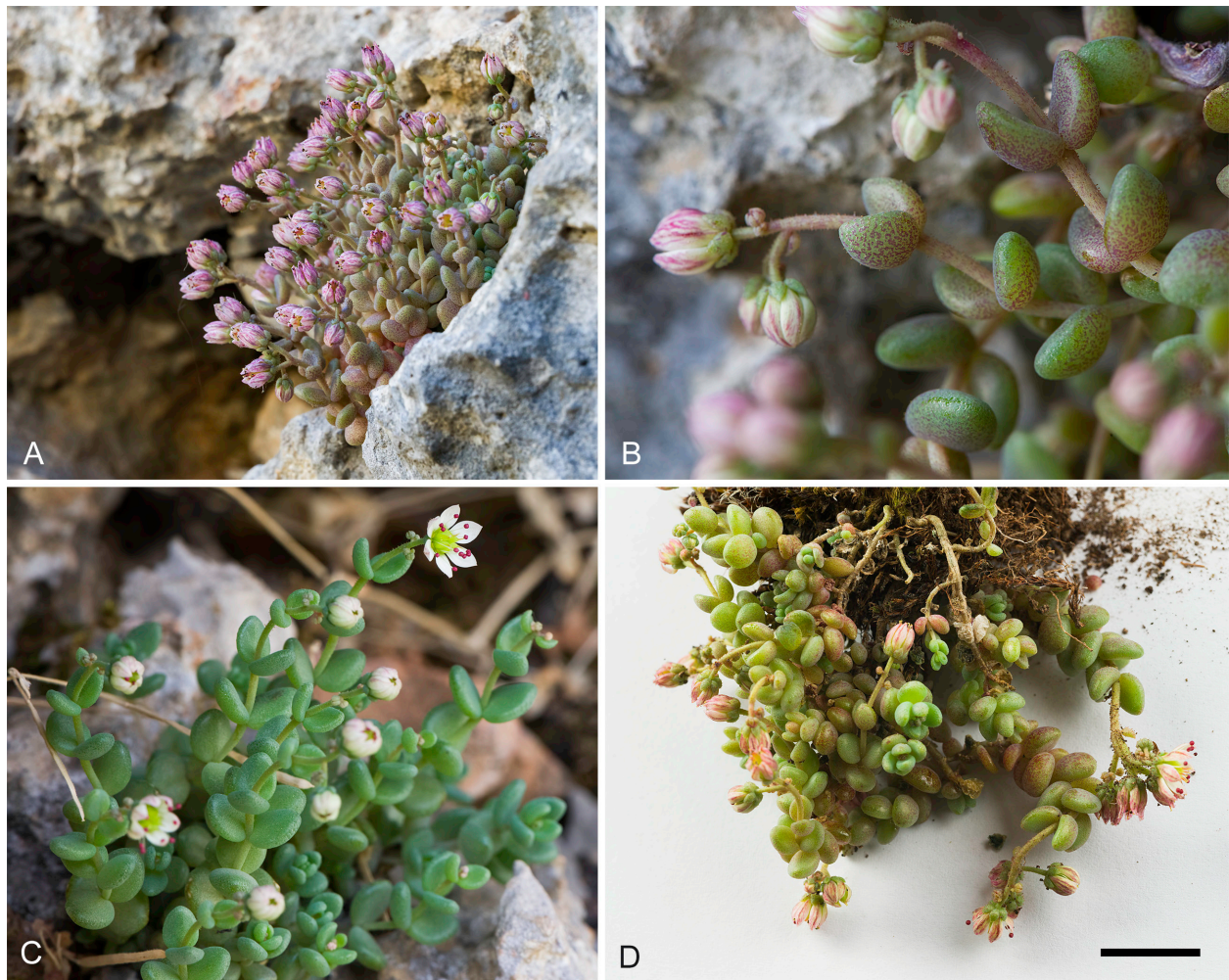
Fig. 1. Sedum dasyphyllum subsp. dasyphyllum – A: plant at beginning of anthesis, flowers not fully open; B: detail of flowering stems and inflorescences; C: plant with open flowers; D: herbarium specimen before pressing ( Bienvenu , UPA), scale bar = 10 mm. – Greece: Crete, Lefka Ori, near the Gefyrakia spring, 20 Jun 2021 (A), 22 Jun 2021 (B–D), all photographs by J. Bienvenu.

as vulnerable (VU D1+2) in Spain because: (1) the entire population is included in one 1 \times 1 km square; (2) it has fewer than 1000 mature individuals; and (3) recolonization from neighbouring French and Andorran populations is possible.