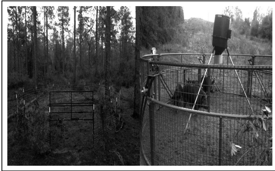
Figure 3. Examples of remotely activated corral traps and captured wild pigs in a remotely operated trap at the Savannah River Site, South Carolina, USA, 2015–2016.