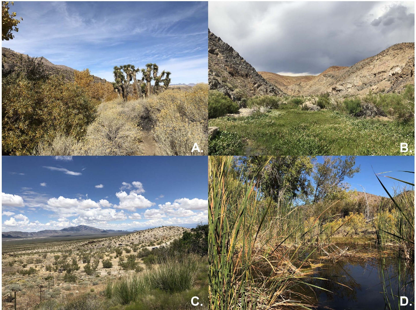
Figure 2. —Photographs of four desert springs sampled. (A) Lower Centennial Spring, Inyo County. (B) Miller Spring, Inyo County. (C) Wildhorse Spring, San Bernardino County. (D) Vaughn Spring, San Bernardino County.

In contrast, of the 296 upland plant taxa we documented, only 6.7% were nonnative taxa, and their life forms primarily consisted of annual herbs (54%), shrubs (19.8%), and perennial herbs (15.8%) (Supplemental Data Table 1). Asteraceae was the most species-rich family among upland taxa (21.6%).