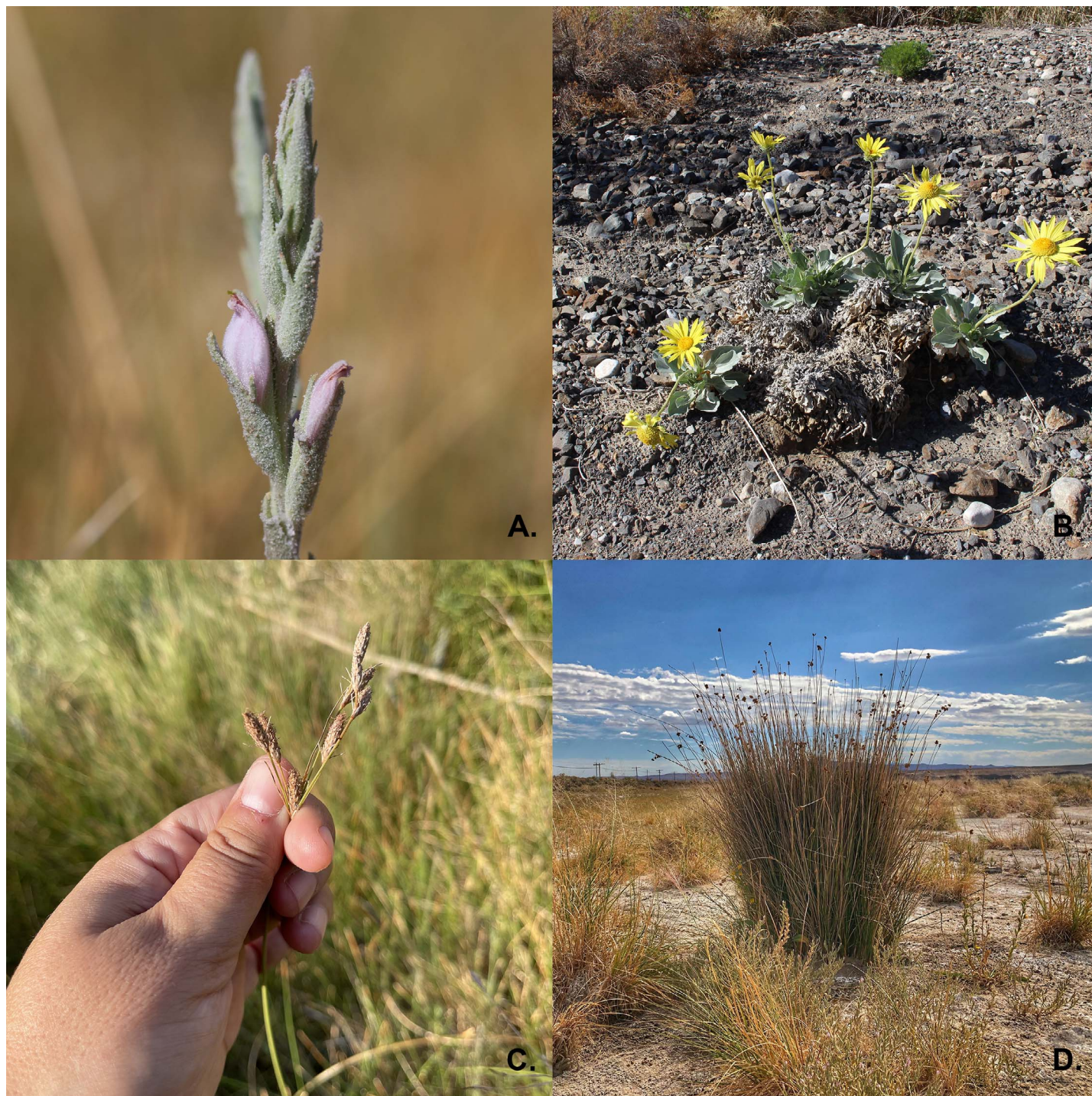
Figure 4. —Selected rare plants documented as a part of this study. (A) Chloropyron tecopense (Orobanchaceae). (B) Enceliopsis covillei (Asteraceae). (C) Fimbristylis thermalis (Cyperaceae). (D) Juncus cooperi (Juncaceae).

and dominate habitats (Curtis and Bradley 2015; Brooks et al. 2016).