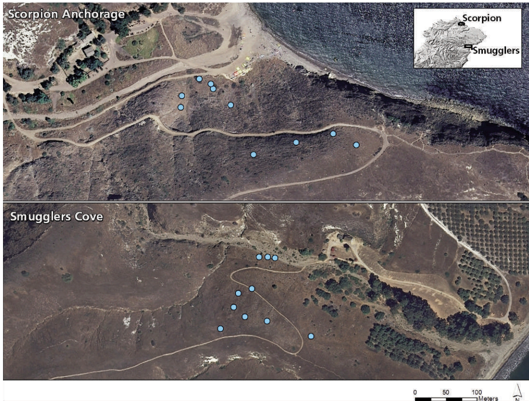
Fig. 1. Study areas in Scorpion Anchorage and Smugglers Cove, Santa Cruz Island, California. Dots indicate locations of fennel plot pairs. Inset shows location of sites on east Santa Cruz Island.

communities across much of the island (Cohen et al. 2009).