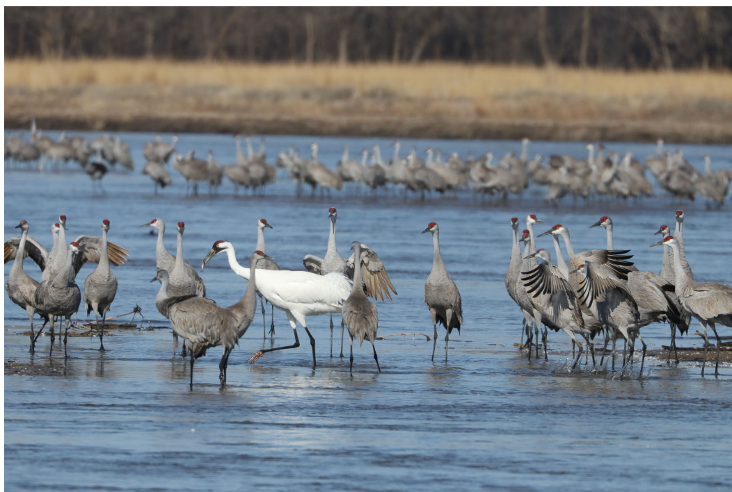
Fig. 1. Photo of an adult Whooping Crane ( Grus americana ), with a channel catfish ( Ictalurus punctatus ; estimated at just over one year old) in its bill, moving among Sandhill Cranes ( Antigone canadensis ) on 22 March 2018 at about 10:30 on the main channel of the Platte River, Hall County, Nebraska, USA.

add to the sparse information concerning Whooping Crane diet during migration by describing an observation novel to the scientific literature regarding an adult feeding on multiple juvenile channel catfish ( Ictalurus punctatus ) in the CPRV.