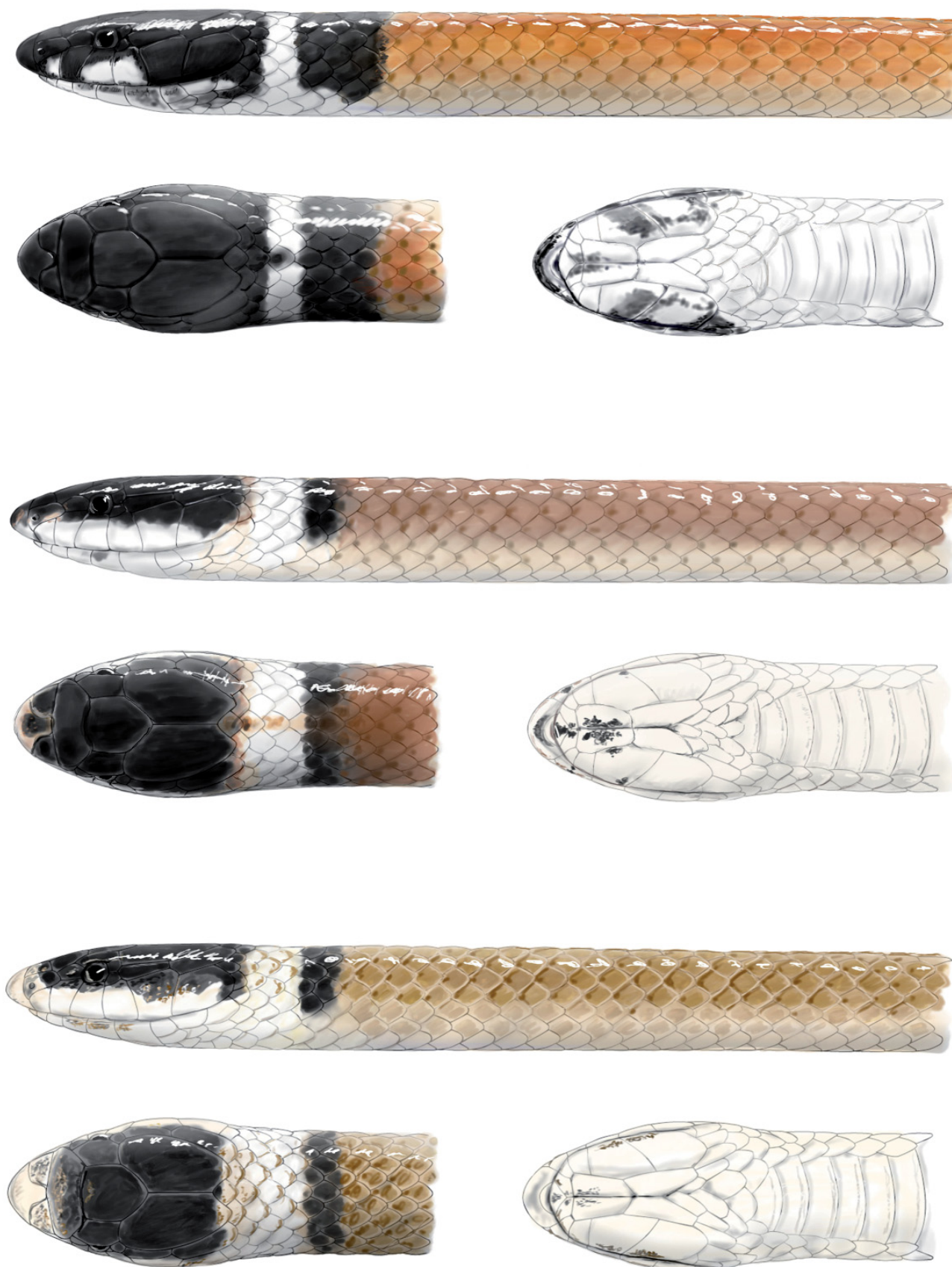
Fig. 2. Morphological variation of Phalotris concolor . Top: Juvenile male (CHUNB 51553, former holotype of P. cerradensis ); Middle: Adult male (MZUFV 1890); Bottom: Adult female (MZUFV 1870).