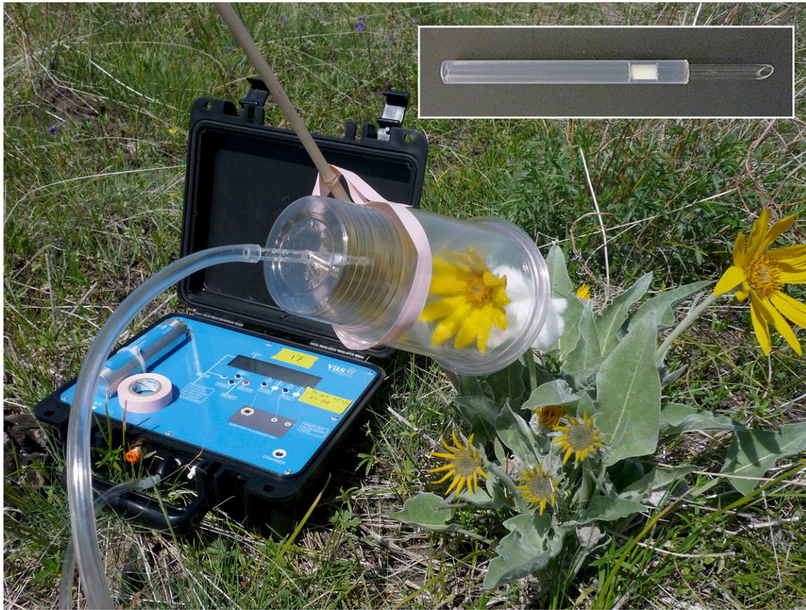
Fig. 2. Collecting VOCs from flowers of arrowleaf balsamroot ( Balsamorhiza sagittata (Pursh) Nutt.) in the field. This setup is being used by the authors to study the effects of environmental change on floral scent and pollinator attraction. The inset shows a volatile collection trap containing a bed of the adsorbent HayeSep Q. Details of this setup are provided in Appendix 1.