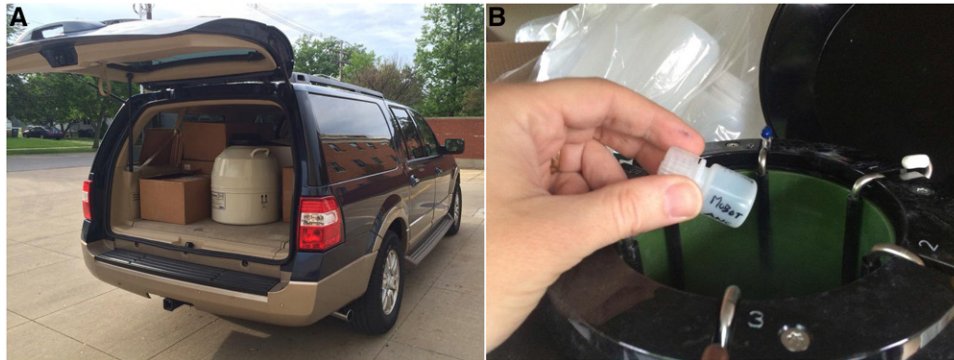
Fig. A2-1. (A) Field collection setup, with the trunk of the field vehicle doubling as a wind-blocking, sample processing workbench. (B) Placing sample bottles directly into the liquid nitrogen tank for the duration of the trip.

The field collection setup uses the trunk of the field vehicle as storage and as a wind-blocking, sample processing workbench (Fig. A2-1A).