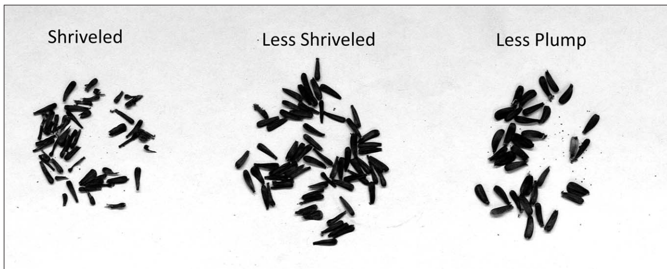
Figure 2. Seed morphological categories. Harvested seeds were separated into four categories according to physical attributes delineating probable viability: shriveled, less shriveled, less plump, and plump. Shriveling was the main characteristic taken into account, along with coloration and the shape of the ends of the seed coat. Shriveled seeds were often discolored brown, while other categories were dark gray. Furthermore, the plumper seeds were, the rounder and more full they appeared.