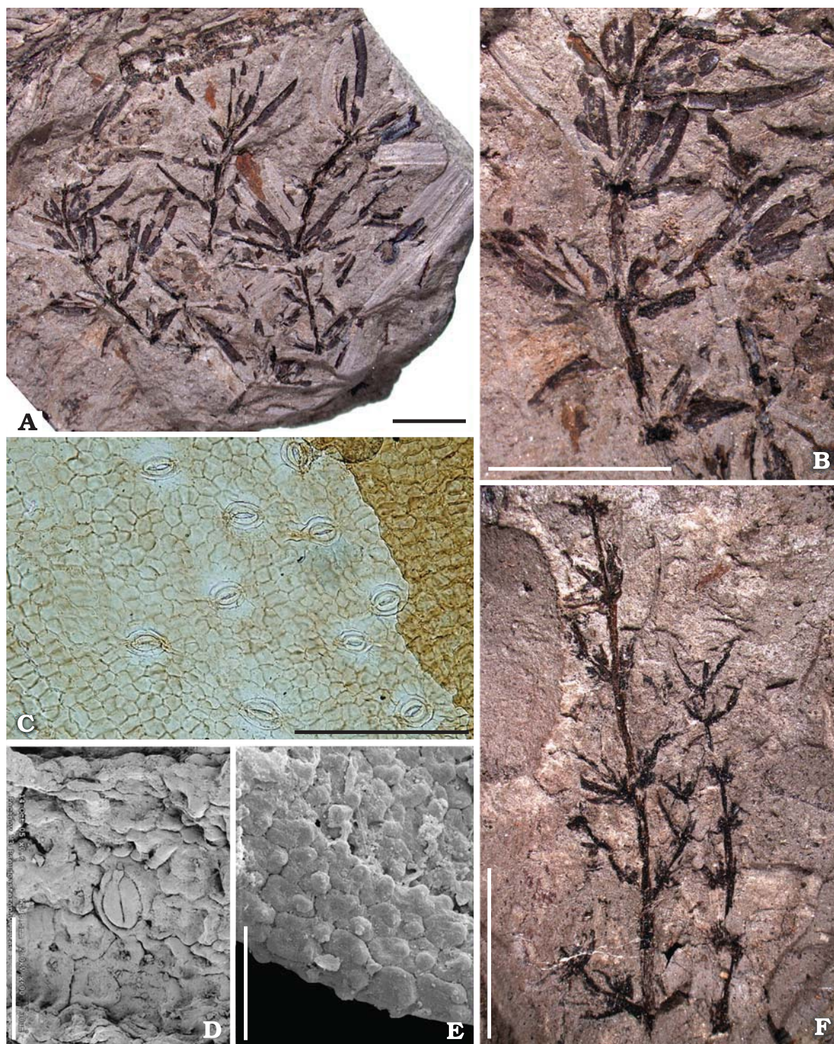
Fig. 1. Early angiosperm Pseudoasterophyllites cretaceus O. Feistmantel ex Velenovský, 1887 from the Late Cretaceous (Cenomanian) of Czech Republic. A. Lectotype, branched leafy axis, Lipenec, NMP F 654. B. Detail of lectotype, showing semi-whorled arrangement of leaves, Lipenec, NMP F 654. C. Leaf cuticle with stomata arranged perpendicularly, longitudinally, and obliquely to the leaf axis, Pecínov (unit 3), NMP F 2880a. D. External surface of paracytic stoma, Pecínov (unit 3), NMP F 2880a. E. Papillae in marginal part of the leaf, Pecínov (unit 3), NMP F 2880b. F. Axillary branches on a leafy twig, Pecínov (unit 3), NMP F 2880. Scale bars A, B 5 mm; C 100 \mu m; D, E 50 \mu m; F 10 mm.

1954 Pseudoasterophyllites cretaceus O. Feistmantel ex Velenovský 1887; Teixeira 1954: 144, figs. 1, 2.