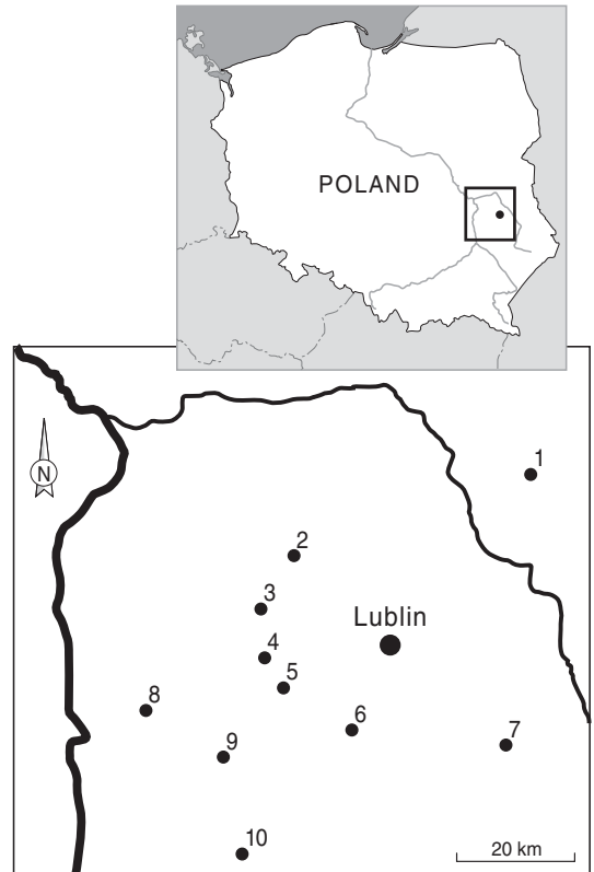
Figure 1. Map of the study area showing the distribution of fishponds complexes: 1 - Uścimów, 2 - Samokłęski, 3 - Garbów, 4 - Czesławice, 5 - Antopol, 6 - Niedrzwica, 7 - Piaski, 8 - Opole Lubelskie, 9 - Chodel, 10 - Kraśnik.

In Poland, fishponds, eutrophic natural lakes and flooded river valleys are the most important breeding habitats for Bitterns (Dombrowski 2004). This study was carried out in 2003–06 at the fishponds of Samokłęski, Garbów, Kraśnik, Uścimów, Czesławice, Niedrzwica, Piaski, Chodel, Opole Lubelskie and Antopol located in the Lublin region, eastern Poland (50°55'–51°29'N; 21°58'–22°54'E; Fig. 1). Fishponds varied in size from 14 to 185.5 ha and were partially covered (range from 0 to 90%) by vegetation stands dominated by Common Reed Phragmites australis , Reed Mace Typha angustifolia and sedges Carex sp. (Fig. 2). Maximum water depth in emergent vegetations varied from 0 to 120 cm. Fish-rearing mostly involved Common Carp Cyprinus carpio (95–100% in biomass), and was characterised by extensive management with occasional reed cutting.