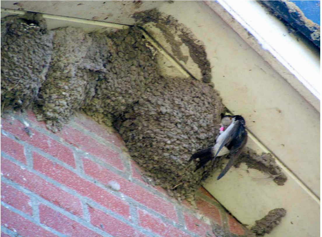
Figure 1. Female IPiPi feeding a large nestling at North 8 in the afternoon of 1 September 2007, the nest where she also raised her first brood. See www.ardeajournal.nl for a full-colour version of this picture.

If we accept that female IPiPi was indeed provisioning two second broods in late August and early September, what made a member of a species where social monogamy is the rule, and only polygamy by males is regarded as a possibility (Turner 2004), engage in such apparent polyandry? Apparent, as we have no proof that IPiPi was actually the mother of the chicks in either North 8 or East 4, or involved in the incubation of the latter clutch. What we know is that perhaps IGnY had lost its partner by the time he was captured on 5 July, that there were fights near East 4 on 18 July, that an unringed adult entered it on 22 July, and that no unringed adult was provisioning the nestlings in East 4 during the intense observations in late August or on 1 September (although