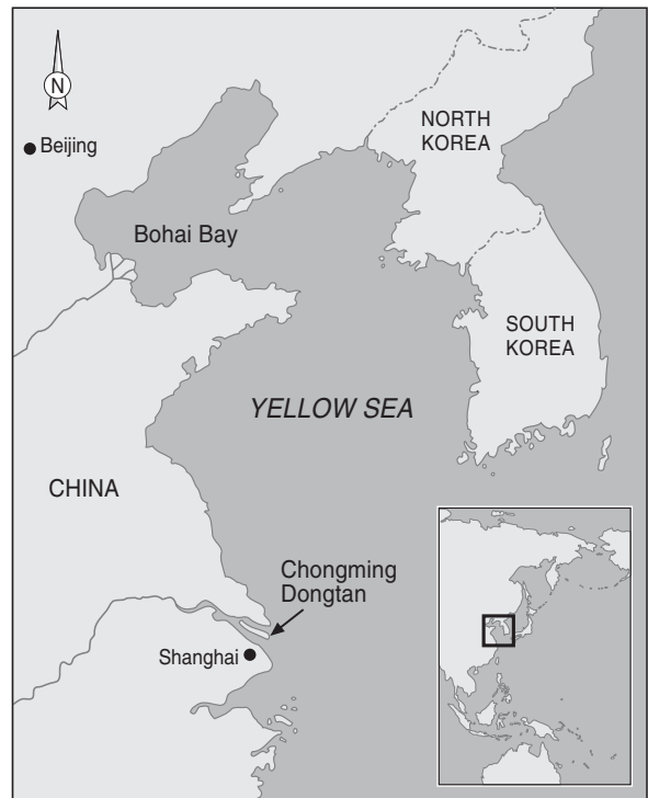
Figure 1. Map of Chongming Dongtan in the Yellow Sea region. The inset shows the location of Yellow Sea region within the East Asian–Australasian Flyway.

Supporting five million migratory shorebirds, the East Asian–Australasian Flyway is a major component of the Global Flyway (Barter 2002, Piersma 2007). Previous research along the East Asian–Australasian Flyway has yielded important insights into the variation in migration strategies of different shorebirds (Battley et al. 2000, 2005, Driscoll & Mutsuyuki 2002, Gill et al. 2005). Based on satellite tracking, recovery records and flight range estimates, these studies have shown that shorebirds are capable of a nonstop trans-oceanic flight between Australia and East China. Moreover, Tulp et al. (1994) suggested that large calidrid sandpipers such as Great Knot and Red Knot, fly directly from northwest Australia to the east China coast, while small species such as Red-necked Stint Calidris ruficollis are bound to stage and refuel in southeast Asia before continuing their northward migration. Their hypotheses are supported by the observation of Red-necked Stints in large flocks in southeast Asia