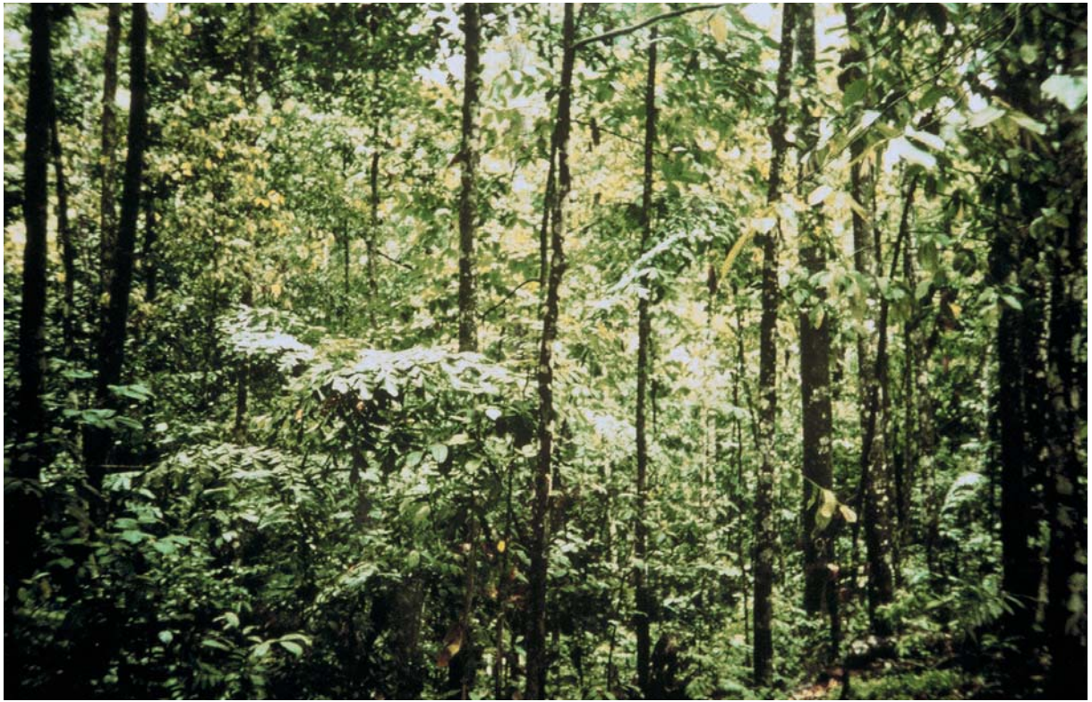
Figure 4. Twenty-year-old restored forest. It will be many more years before this provides natural holes and cavities for owl to nest in. Los Banos Botanical Gardens, Luzon, Philippines.

them in a broad range of initiatives will in the long run, bring greater benefits than excluding them. These should include the development of ecotourism to highlight the value of conserving the forests and their unique wildlife. Such initiatives can help to improve the livelihoods of local populations and demonstrate how sound use of their natural resources can generate a sustainable source of income.