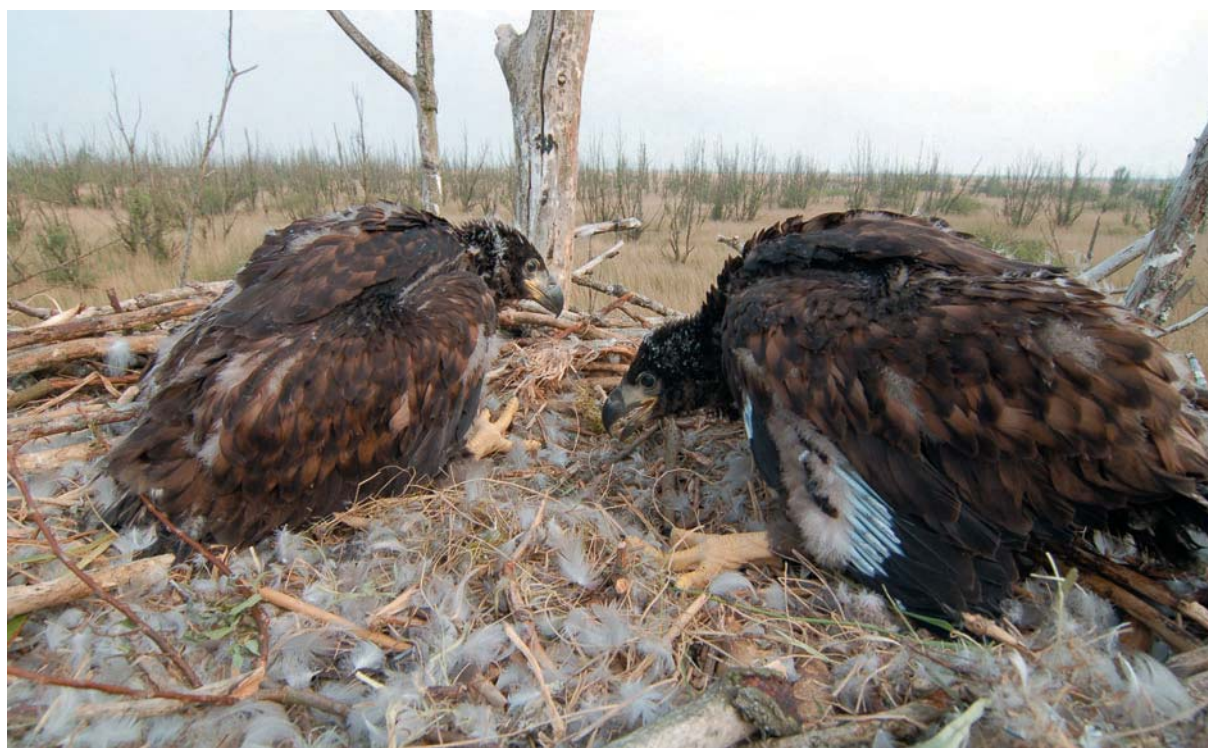
Figure 2. Nest of White-tailed Eagle in the Oostvaardersplassen on 15 May 2008, with view across the marshes showing reedbeds and extensive die-back of willows. This third successful nest produced two fledglings.

by desiccation. Prolonged droughts have a profound negative impact on the survival of Palearctic migratory birds, but this is remedied as soon as rainfall improves (Zwarts et al. 2009). Similarly, the rehabilitation of the Waza Logone floodplains in northern Cameroon was accompanied by increasing numbers of waterbirds, although improved rainfall after the disastrously dry 1980s and colony protection also played a role in this development (Scholte 2006). Even more recently the Mesopotamian marshes of Iraq, once covering 15,000 km 2 of which in 2000 less than 10% remained, have shown a remarkable recovery after dikes were breached and a high volume of good-quality water from the Tigris and Euphrate reflooded 39% of the former marshes. Although it is still too early to celebrate the recovery of this mutilated marshland (and “the stillness of a world that never knew an engine” described in Wilfred Thesinger’s The Marsh Arabs – based on his stay from the end of 1951 until June 1958 – is unlikely to return), the resilience shown by macroinvertebrates, macrophytes, fish and birds is promising (Richardson & Hussain 2006). Suchlike examples of rebounding wetlands are known from all over the world, although they are offset by many more examples of loss (Boere et al. 2006).