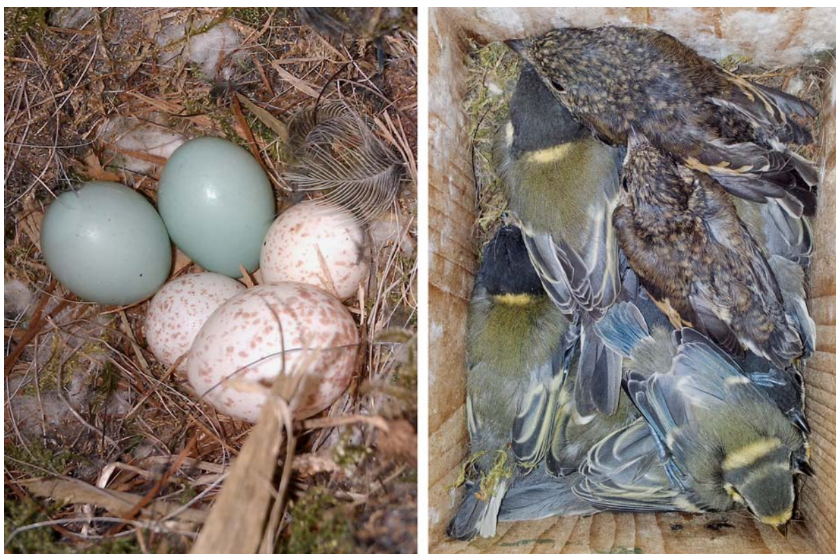
Figure 2. Left panel: two Pied Flycatcher eggs (left), two Blue Tit eggs (middle) and a Great Tit egg (right) after the second takeover. Right panel: a Blue Tit, two Pied Flycatcher and six Great Tit chicks three days before fledging.