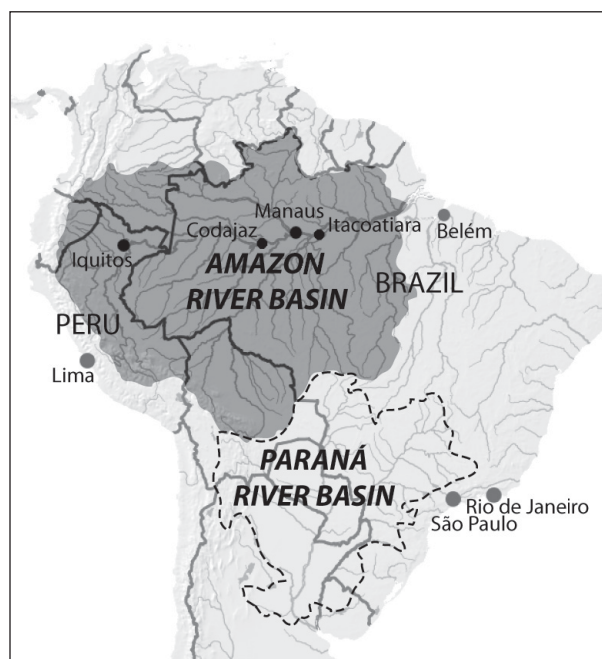
Fig. 6. Map of South America with two principal river basins, Amazon and Paraná Rivers.

Extensive material of proteocephalidean cestodes was collected in a wide spectrum of teleosts during six visits by the present authors and their co-workers to the Peruvian Amazonia. This material will make it possible to compare the species composition of the cestode fauna and host-parasite associations in the Amazon River basin with those in the Paraná River basin (Fig. 6). Some proteocephalideans occur in closely related hosts from different river basins, such as Proteocephalus macrophallus and P. microscopicus in species of Cichla Bloch & Schneider, 1801, or in recently separated 'couples' of fish hosts that occur only in one of the two principal river basins in South America, i.e. Amazon and Paraná, such as Zungaro zungaro in the former river basin and Z. jahu in the latter one.