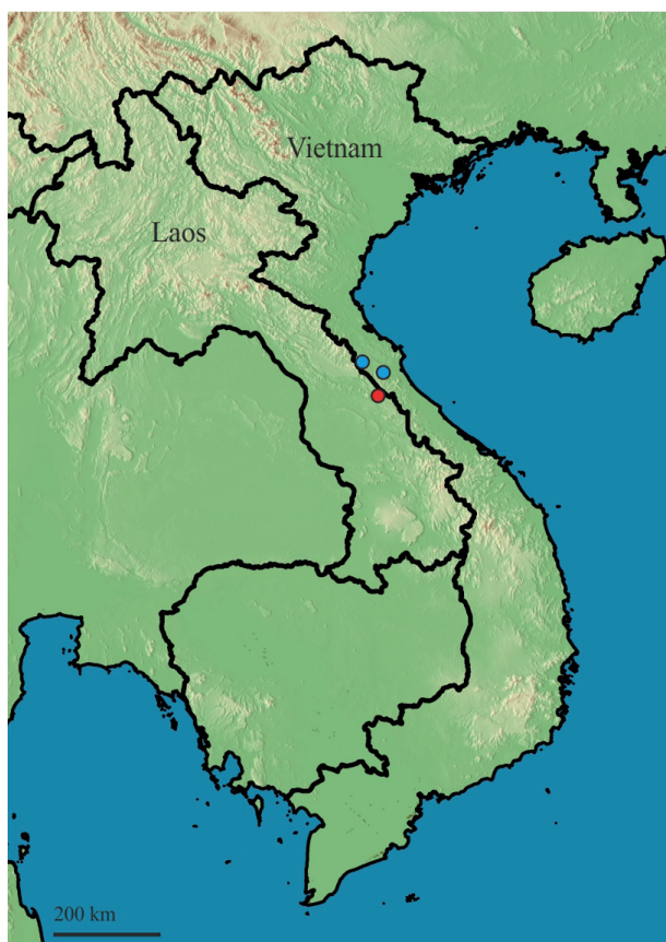
Fig. 1. Map showing the distribution of Gracixalus quyeti , including the localities of the type series after Nguyen et al. (2008) in Quang Binh Province, Vietnam (marked with blue dots) and our first record from Khammouane Province, Laos (marked with a red dot).