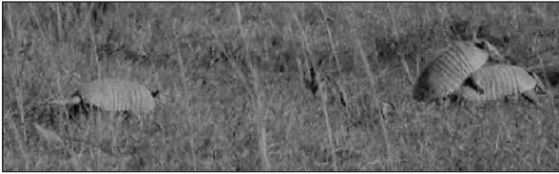
FIGURE 1. A presumably female six-banded armadillo ( Euphractus sexcinctus ) mounted by a presumed male during a collective race, chased by another presumed male, in the Pantanal wetland, Brazil, July 2006.

when we witnessed a successful attempt of one of the 'males' in mounting the 'female'. Five 'males' were in a line running after one 'female', and one of the 'males' mounted the 'female' in a quick movement when it briefly stopped during the chase. After being mounted successfully the 'female' quickly resumed running, with the 'male' still attached ( FIG. 1 ). The remaining 'males' started chasing the couple. The mounted running was as fast as when individuals were running alone and occurred for nearly 20 m, without release by the 'male'.