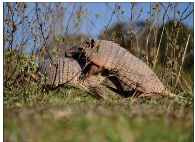
FIGURE 2. A male six-banded armadillo ( Euphractus sexcinctus ) mounting a female during a chase event in the Pantanal wetland, Brazil.

Our records help to clarify at least one of the questions raised by Desbiez et al. (2006). These authors were not certain whether the chasing behavior they reported had a reproductive function or rather represented a strategy to defend territories or food resources. Although no specimen was captured or sex-discriminated, some of the photos we have taken showed the erect penis of the mounting armadillo ( FIG. 2 ), indicating that the chasing and mounting behaviors represent a reproductive event.