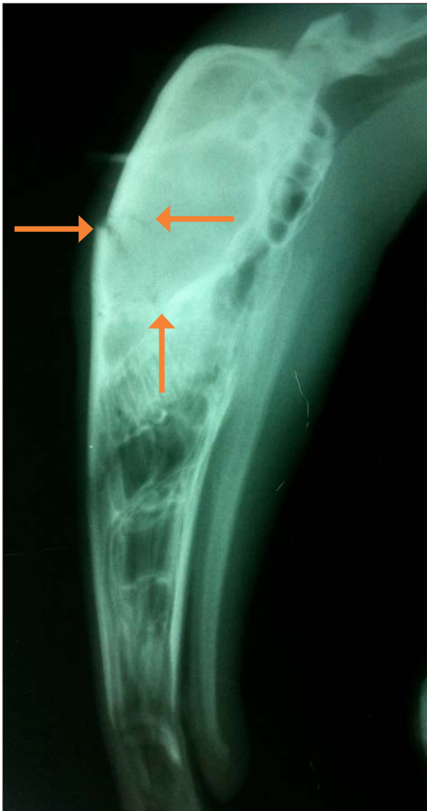
FIGURE 2. Radiograph with a laterolateral view on the tamandua's skull. A fracture of the frontal and parietal bone is visible (arrows).

obtunded. Warm water compresses were applied over the right eye for 10 min three times daily, and bandages were placed on all four paws over-night to prevent manipulation of the surgical wound. On day two meloxicam was not repeated due to dehydration and a concern for renal compromise. A 50 cm × 70 cm × 55 cm sized indoor enclosure provided the tamandua with soft bedding, warmth, and restricted movement. Thirty ml of a blend of mashed avocado, banana, puppy milk formula (Just Born Highly digestible Milk Replacer, Farnam Companies Inc., Phoenix, USA), coconut water, watermelon juice, papaya, and orange juice diluted in water were offered to the tamandua in a syringe every one to two hours. The rehabilitator massaged the tamandua's throat to encourage swallowing while feeding.