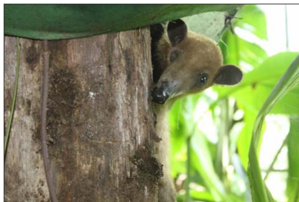
FIGURE 3. Fully recovered tamandua after approximately three months of rehabilitation, climbing one of the trees in the outside-enclosure in order to forage.

Following second surgery, the tamandua was given oral meloxicam (0.1 mg/kg) once daily for five days and 10 mg/kg amoxicillin (Andimox, 50 mg/ml; Laboratorios Andifar, Tegucigalpa, Honduras) orally once daily for ten days. The tamandua took all medications voluntarily with coconut-water. No redness or discharge was present at the surgical site. After the procedure the eye remained slightly swollen for 12 days.